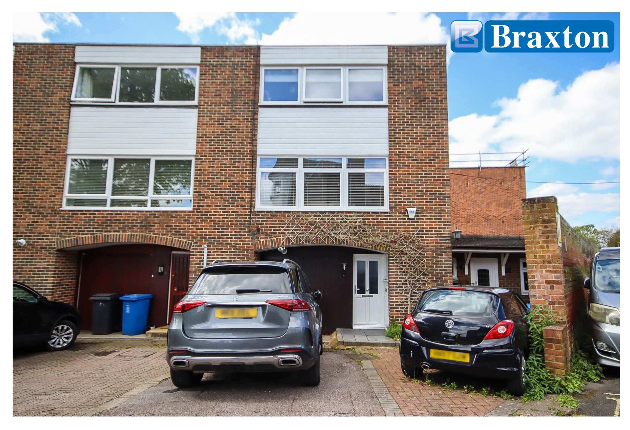
2 Guards Club Road, Maidenhead, Berkshire, SL6 8DN