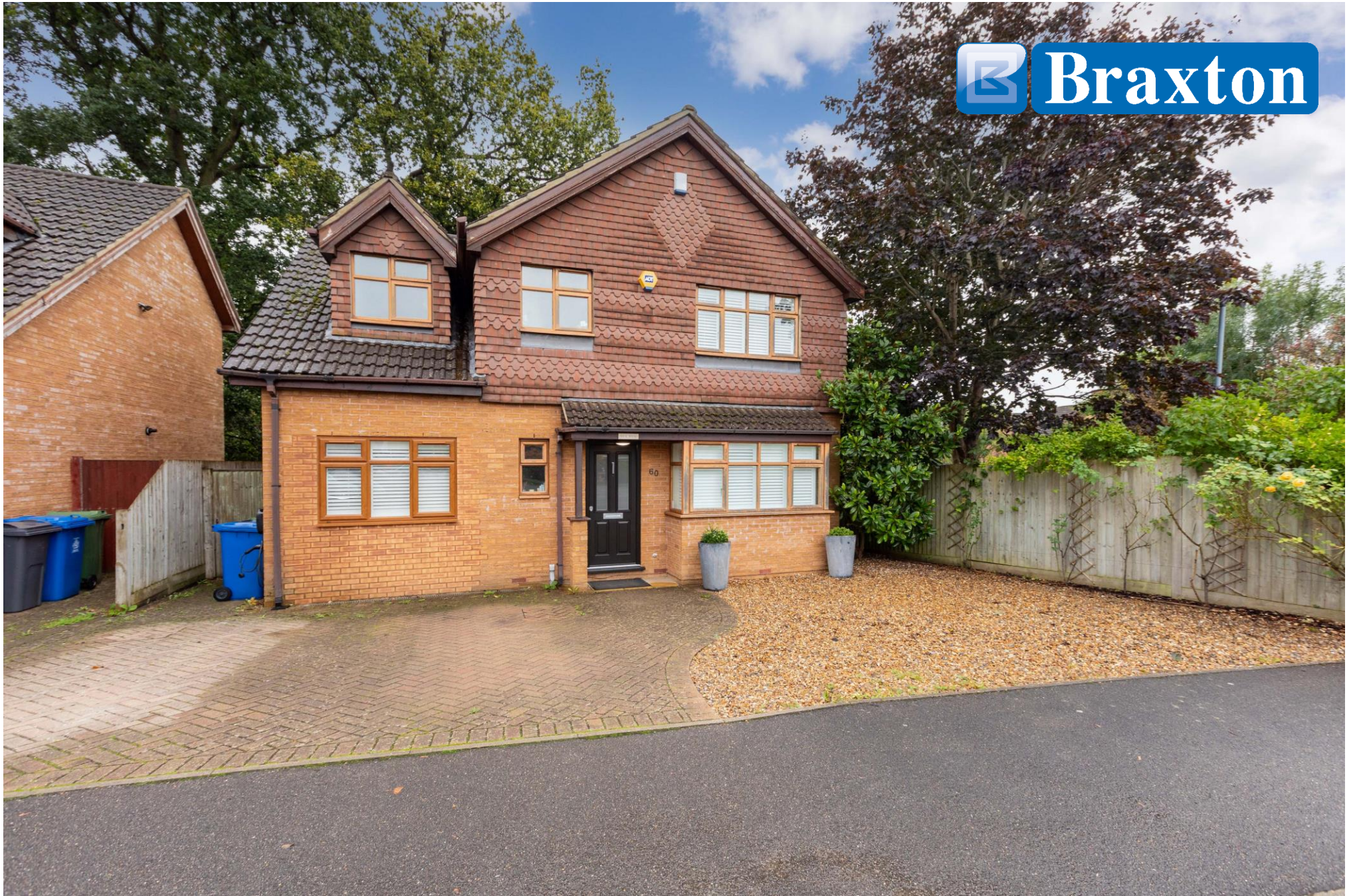
60 Priors Way, Maidenhead, Berkshire SL6 2EN