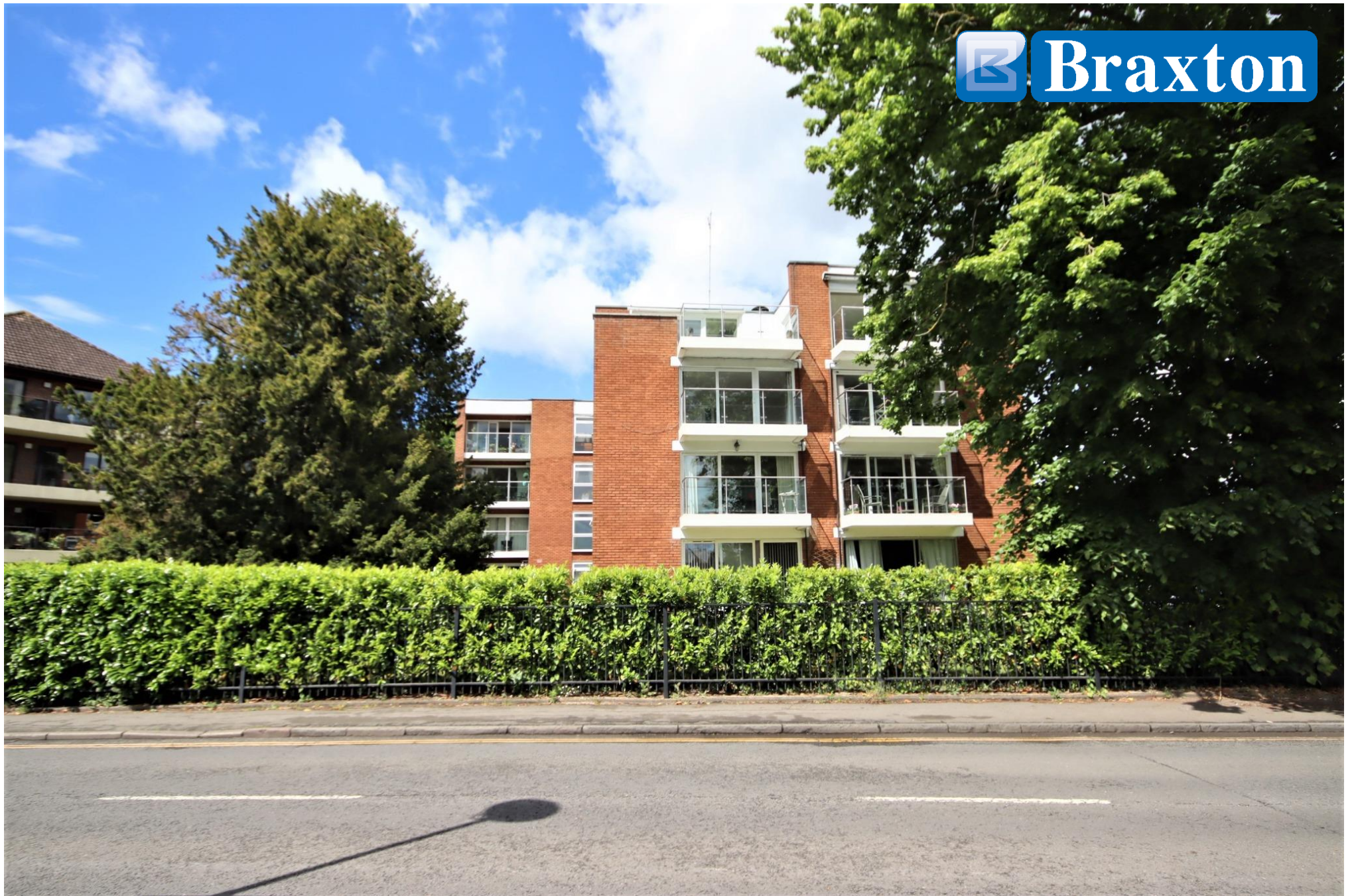
35 Riverine, Grosvenor Drive, Maidenhead, Berkshire, SL6 8PF