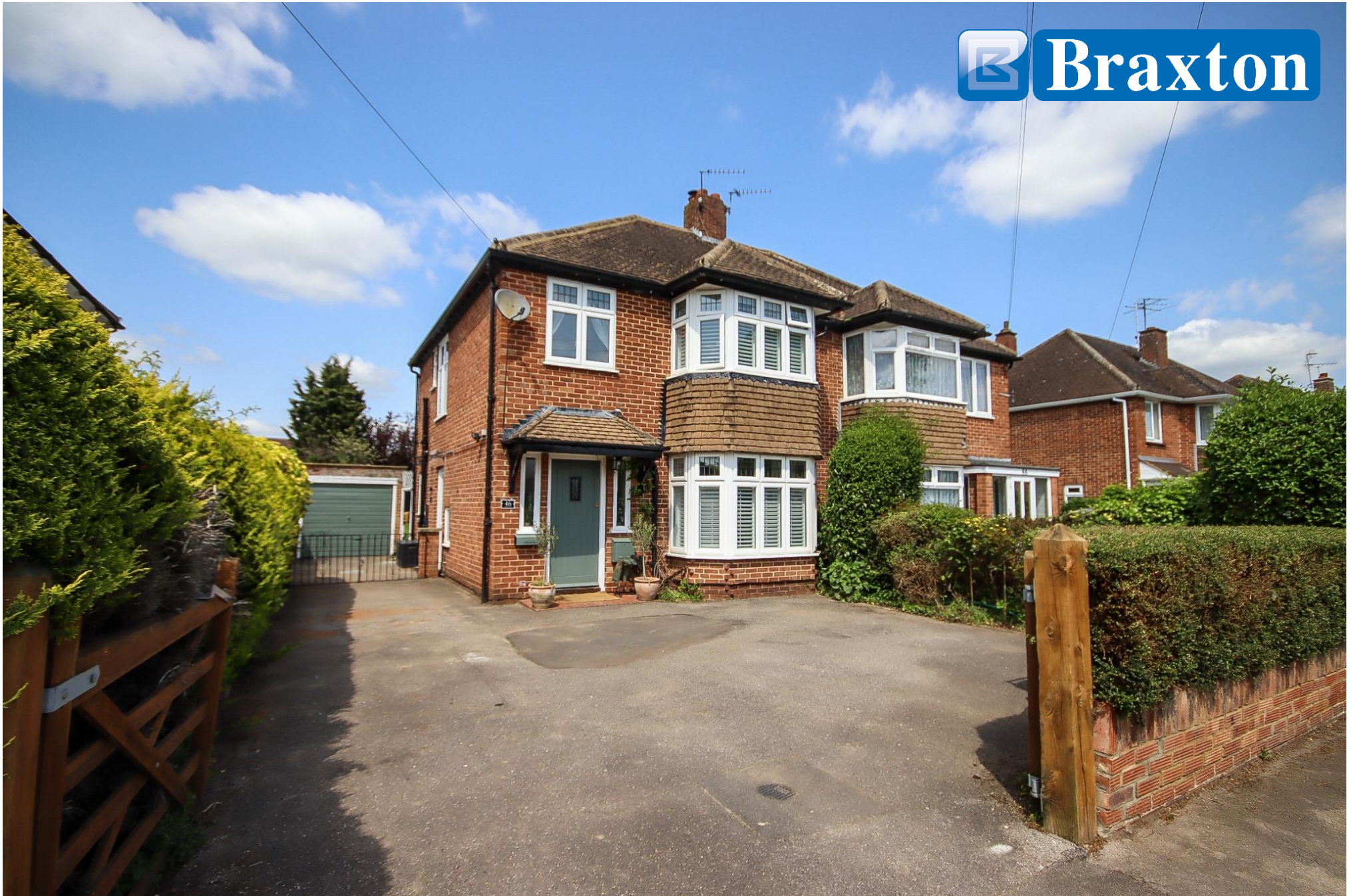
46 Farm Road, Maidenhead, Berkshire, SL6 5JD