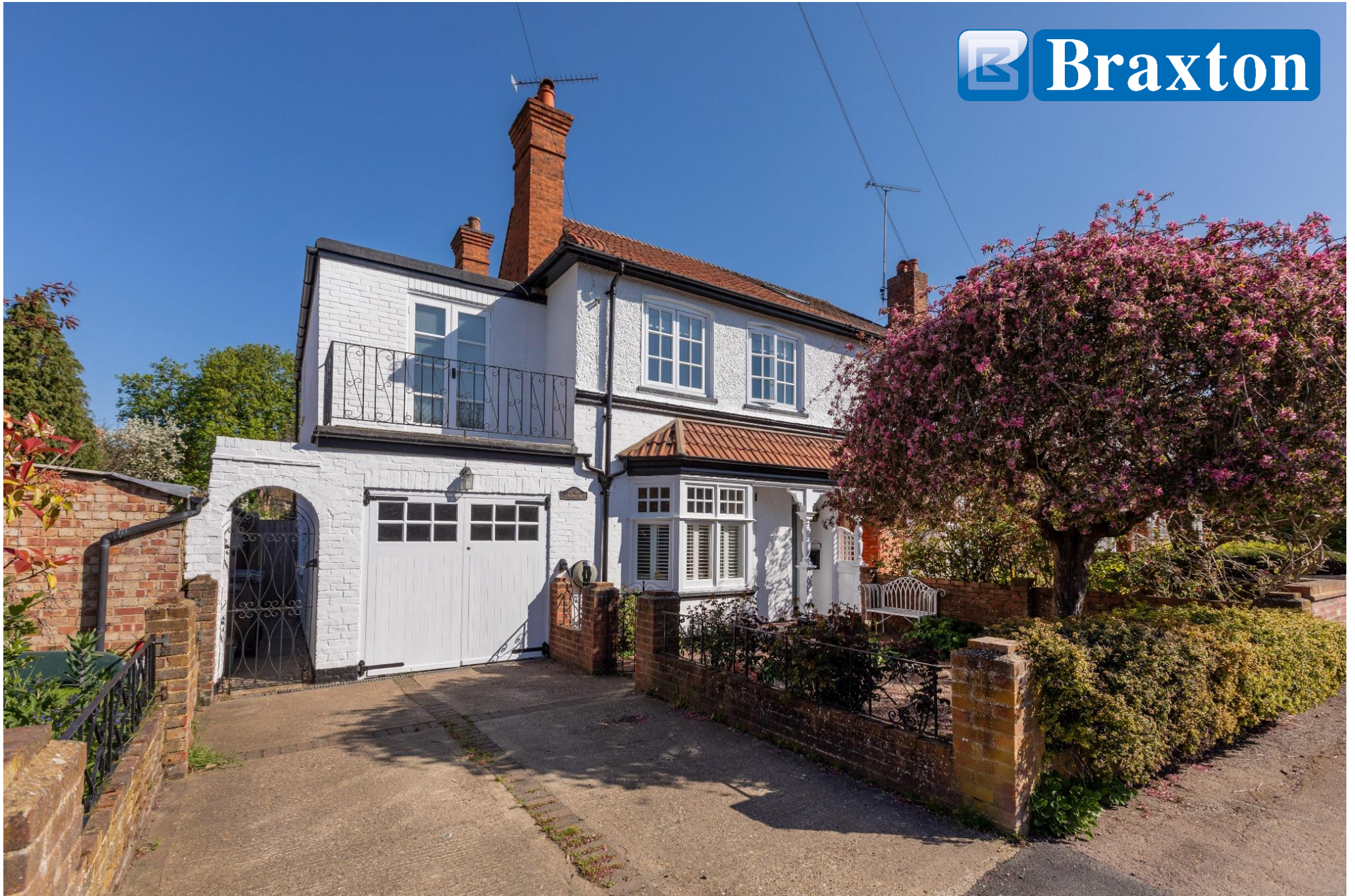
Ashbrooke, Ellington Road, Taplow, Buckinghamshire, SL6 0AX