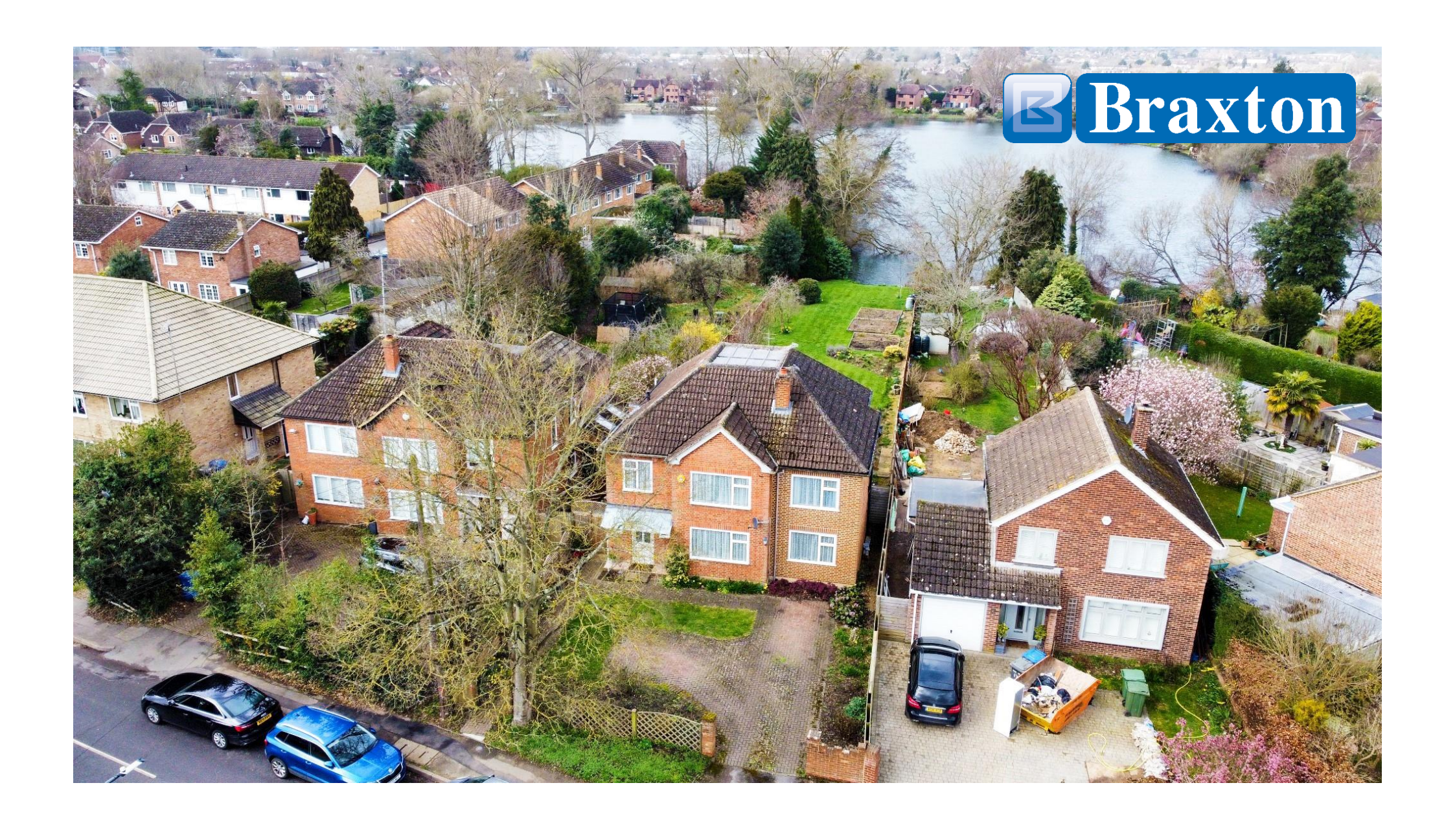
15 Sheephouse Road, Maidenhead, Berkshire, SL6 8ES