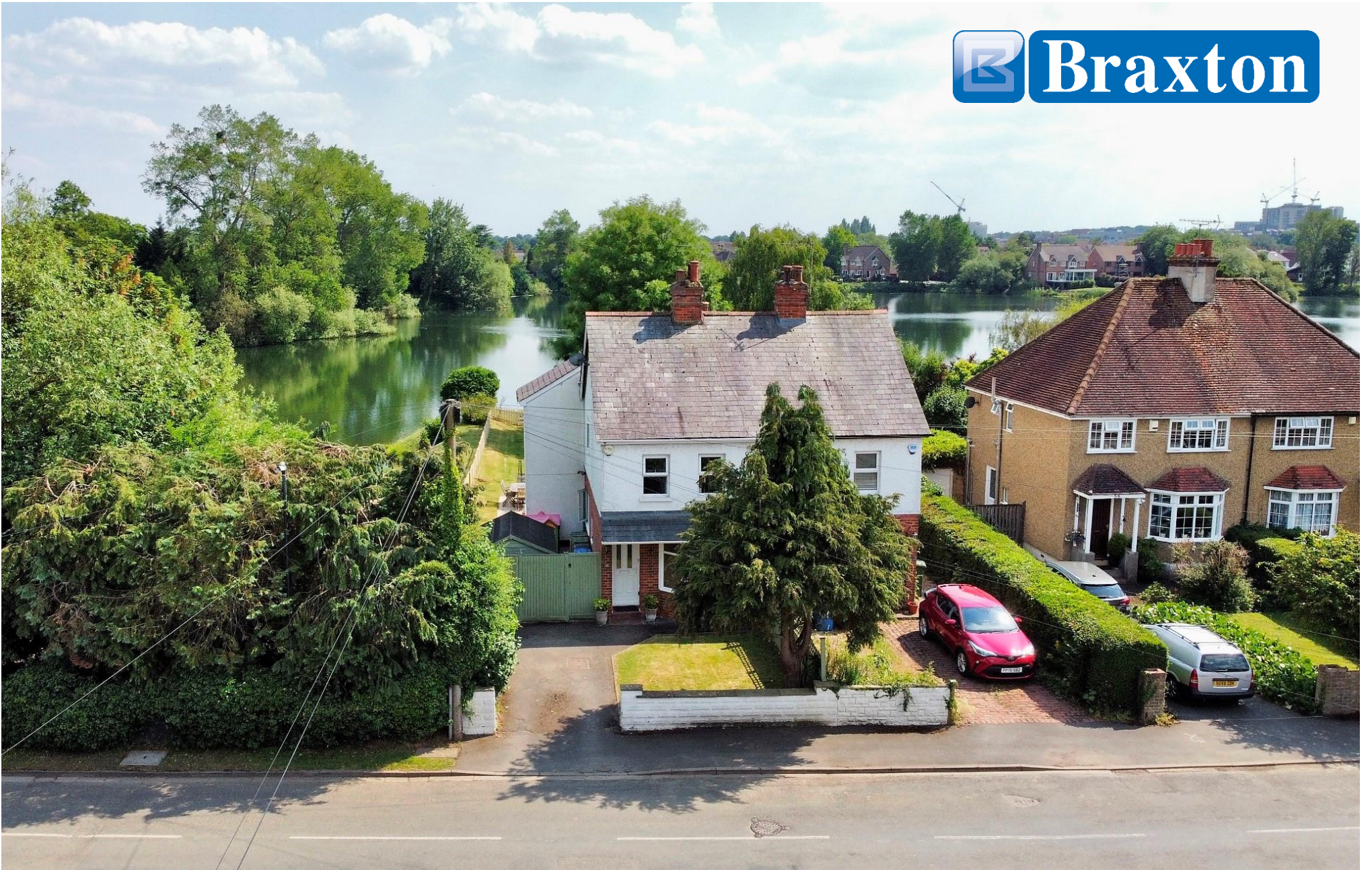
62 Summerleaze Road, Maidenhead, Berkshire SL6 8EP