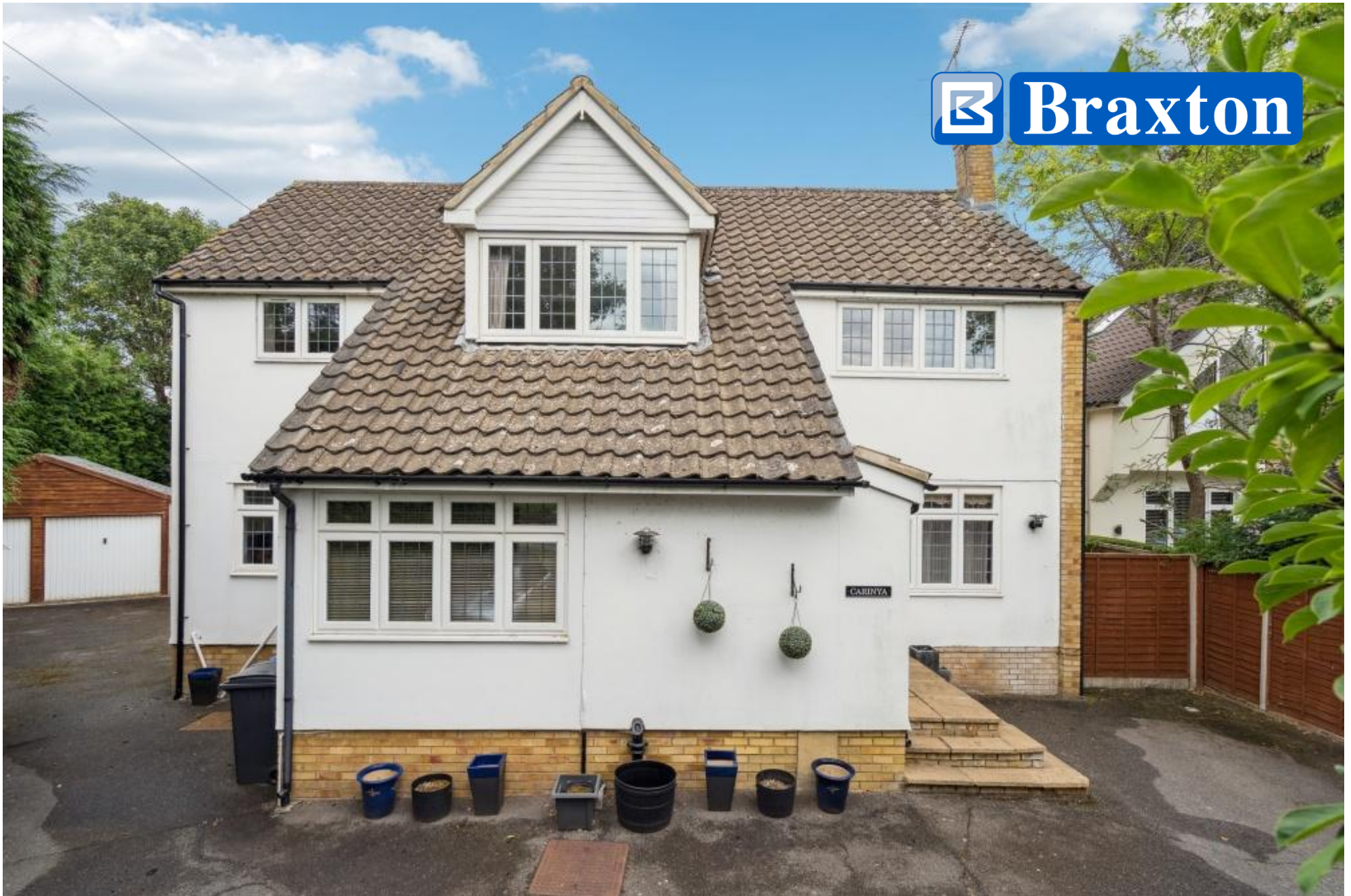
CARINYA, BRAY ROAD, MAIDENHEAD, BERKSHIRE, SL6 1UF