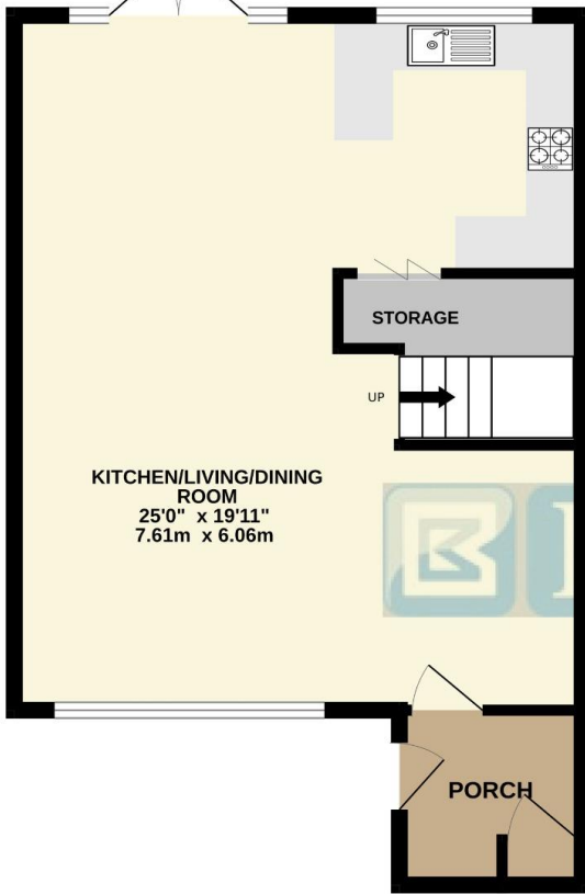
GROUND FLOOR 528 sq.ft. (49.0 sq.m.) approx.