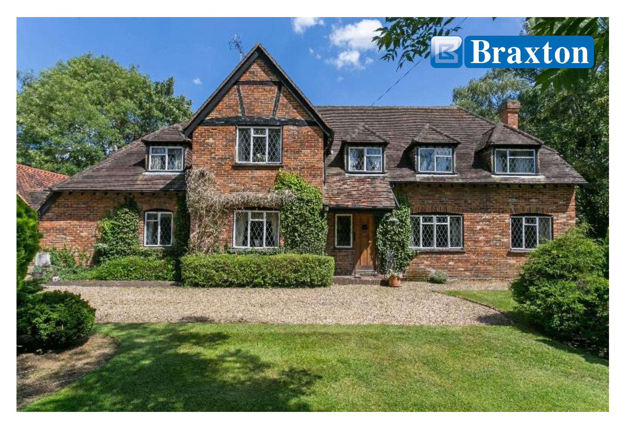
Shaffelmoor House, Ascot Road, Maidenhead, Berkshire SL6 2HT