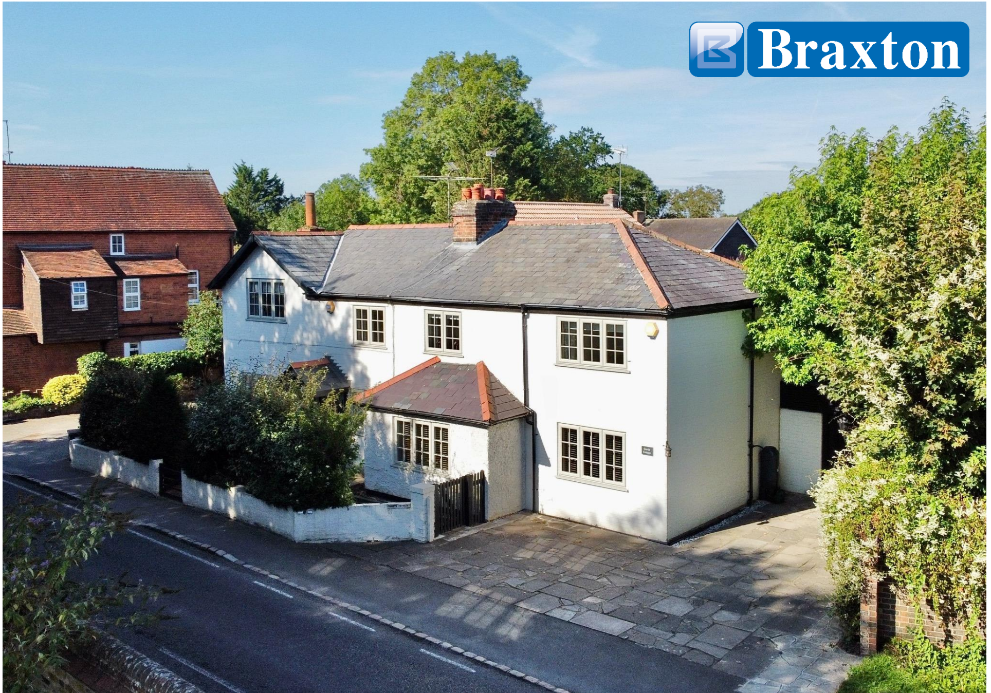
Garth Cottage, Ascot Road, Holyport, Berkshire SL6 2HY