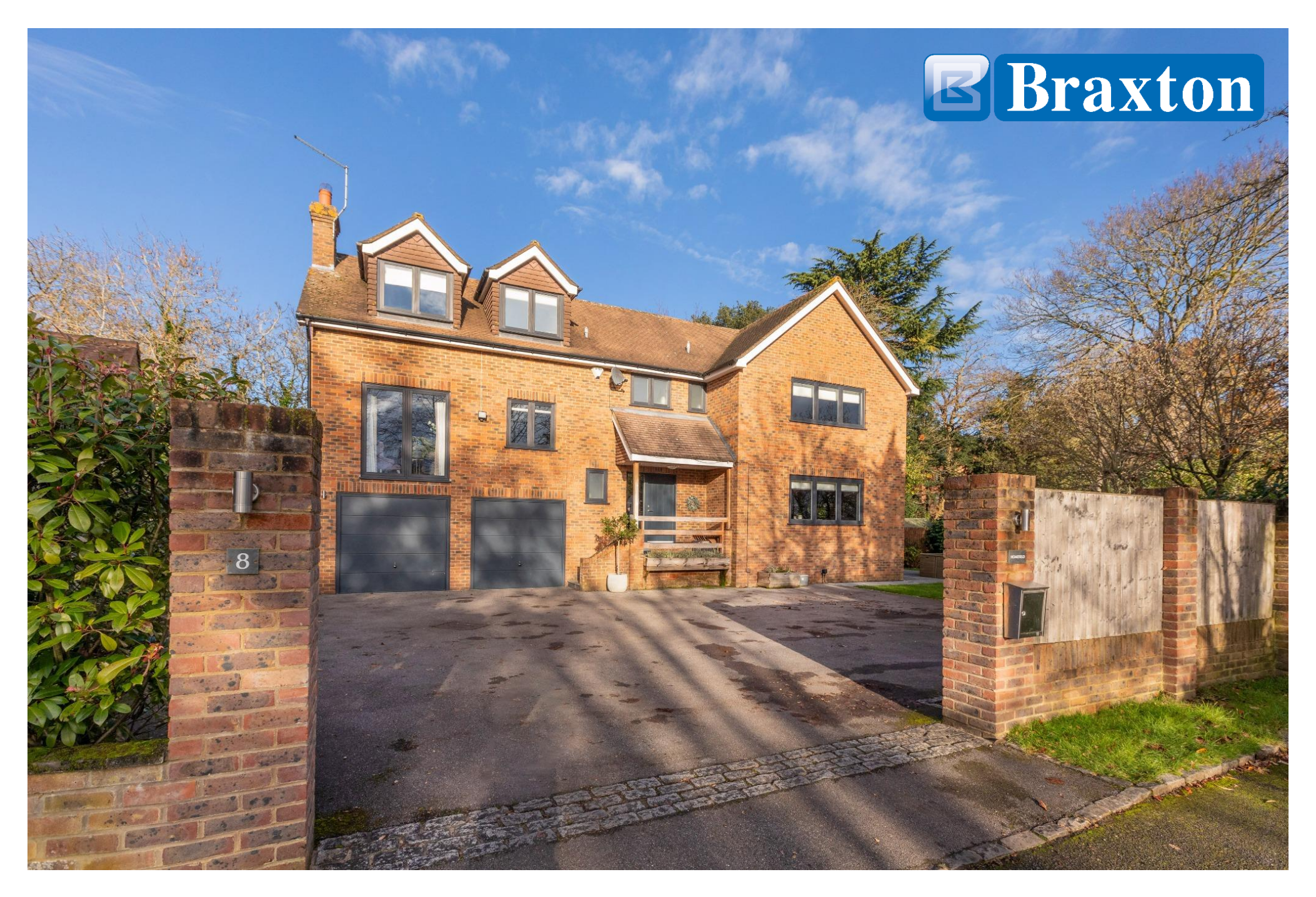
8 Longworth Drive, Maidenhead, Berkshire, SL6 8XA