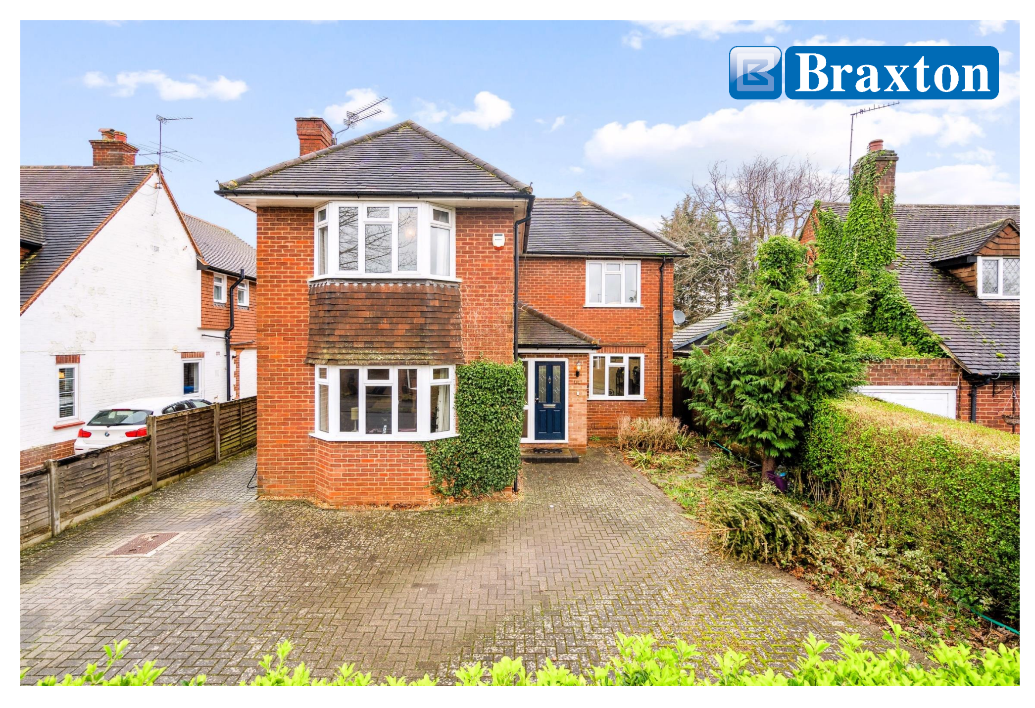
62 Oaken Grove, Maidenhead, Berkshire SL6 6HH