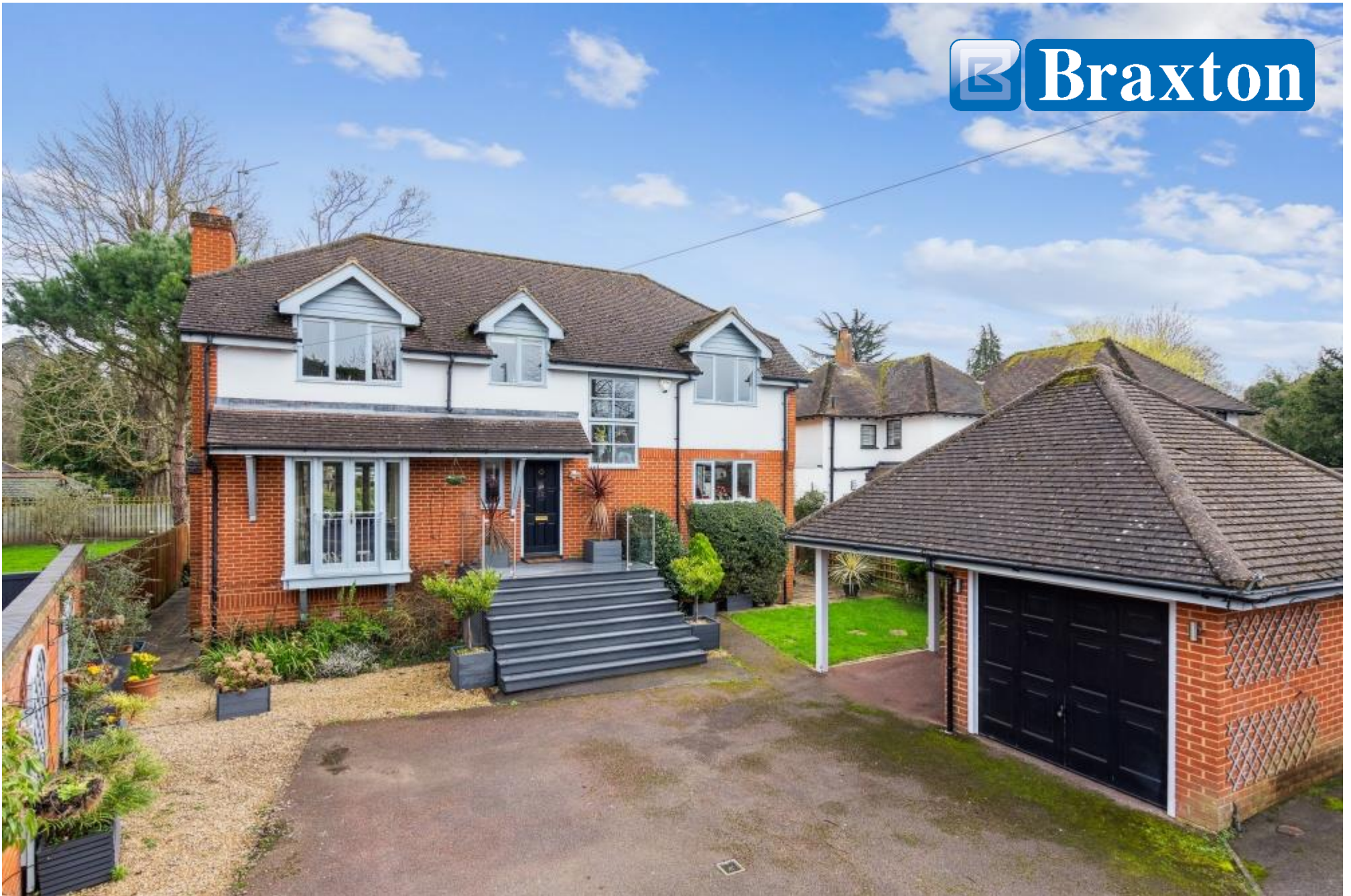
Waterside Place, 10 Lower Cookham Road, Maidenhead, Berkshire SL6 8JT