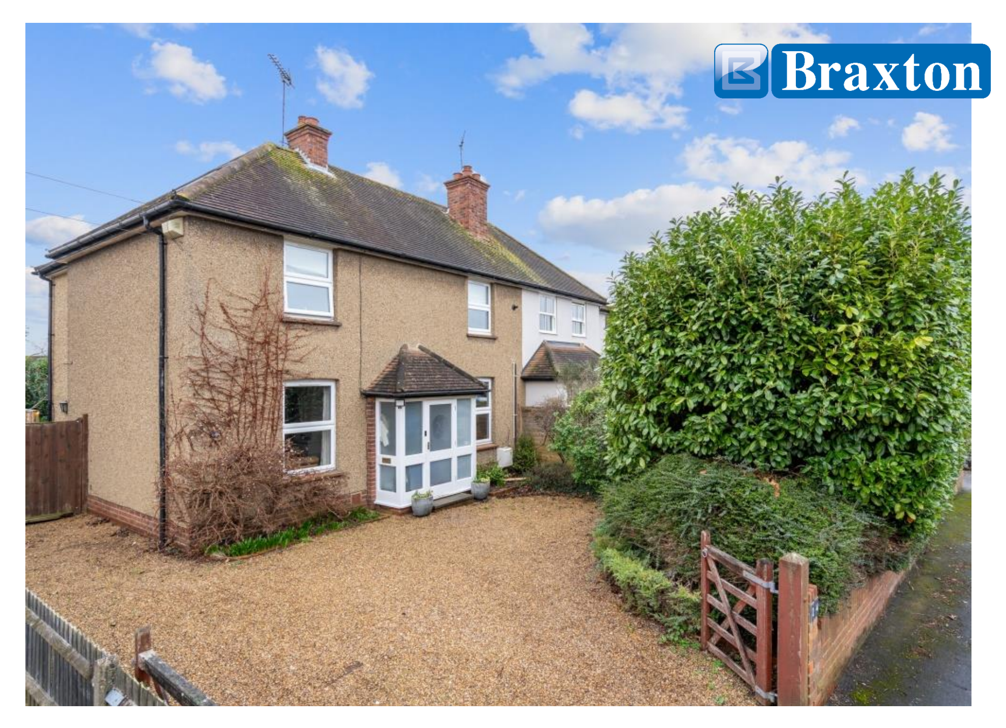
24 New Road, Holyport, Berkshire SL6 2LQ