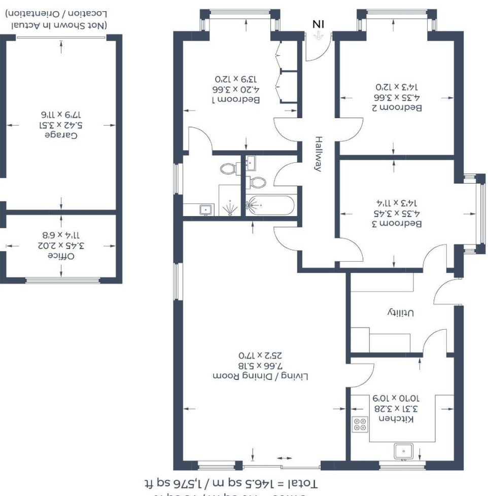
Illustration for identification purposes only, measurements are approximate, not to scale. © CJ Property Marketing Produced for Braxton