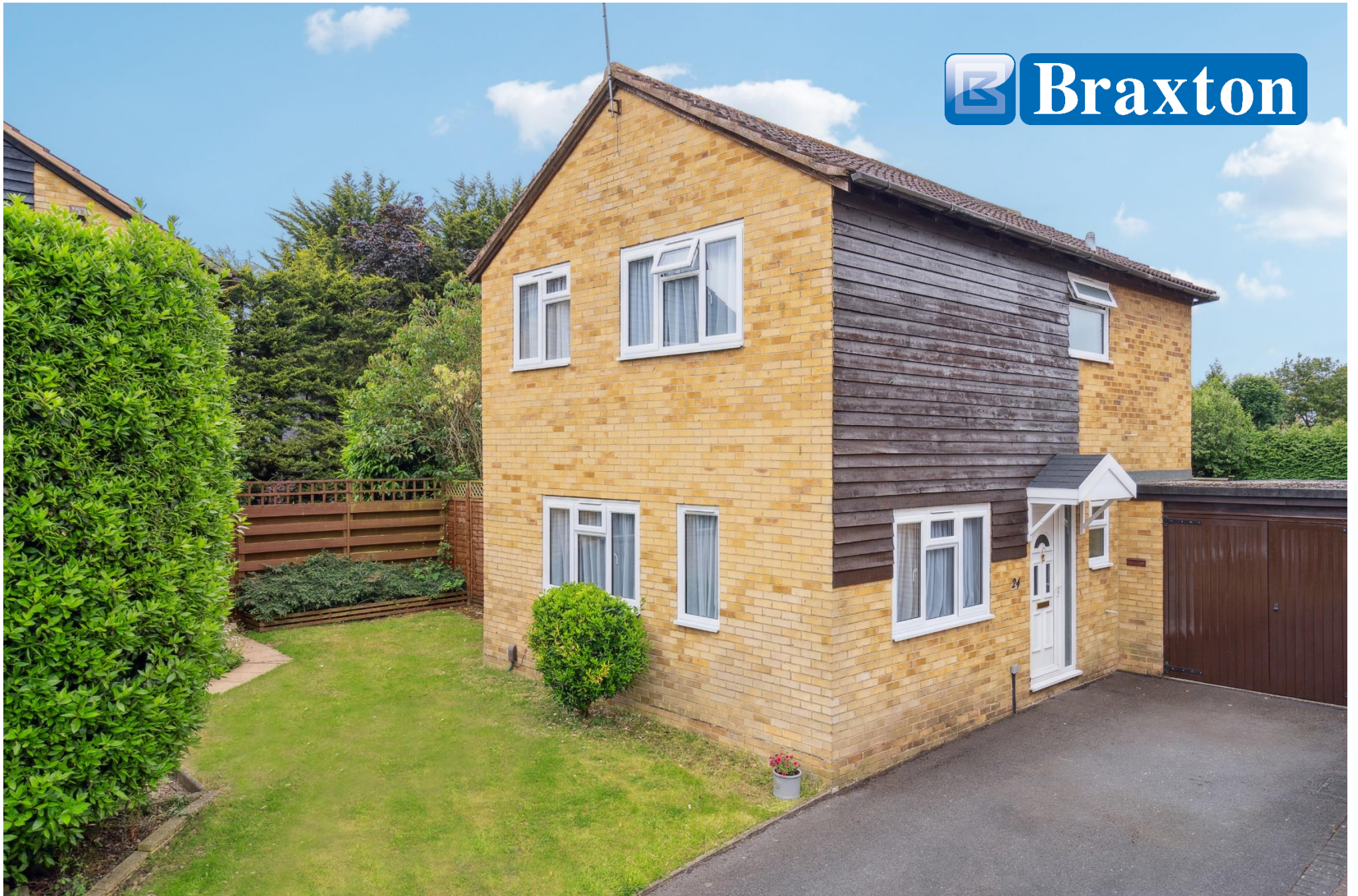
24 Priors Way, Maidenhead, Berkshire SL6 2EL