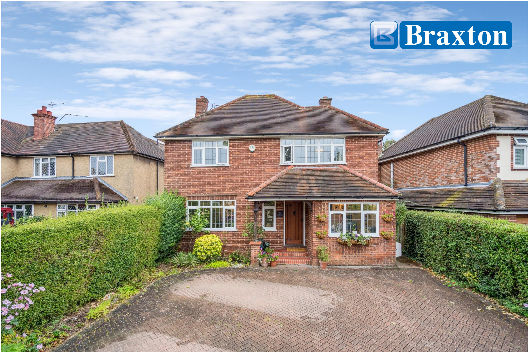
26 Allenby Road, Maidenhead, Berkshire SL6 5BH