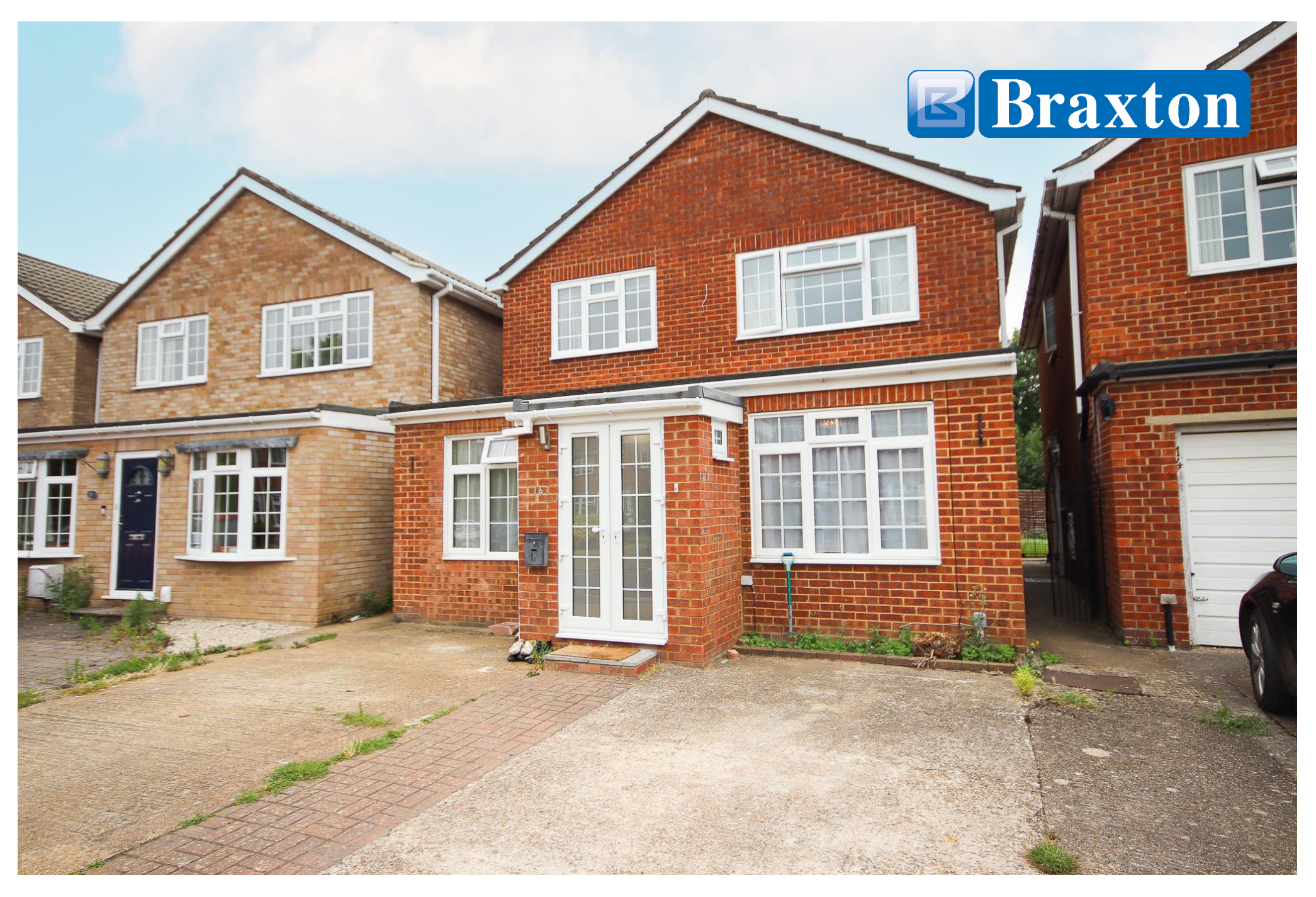
16 Langdale Close, Maidenhead, Berkshire SL6 1SY