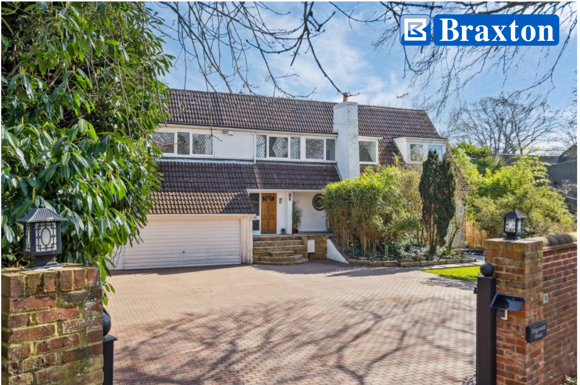
KINGSWORTH HOUSE, GLEBE ROAD, MAIDENHEAD, BERKSHIRE, SL6 1UH