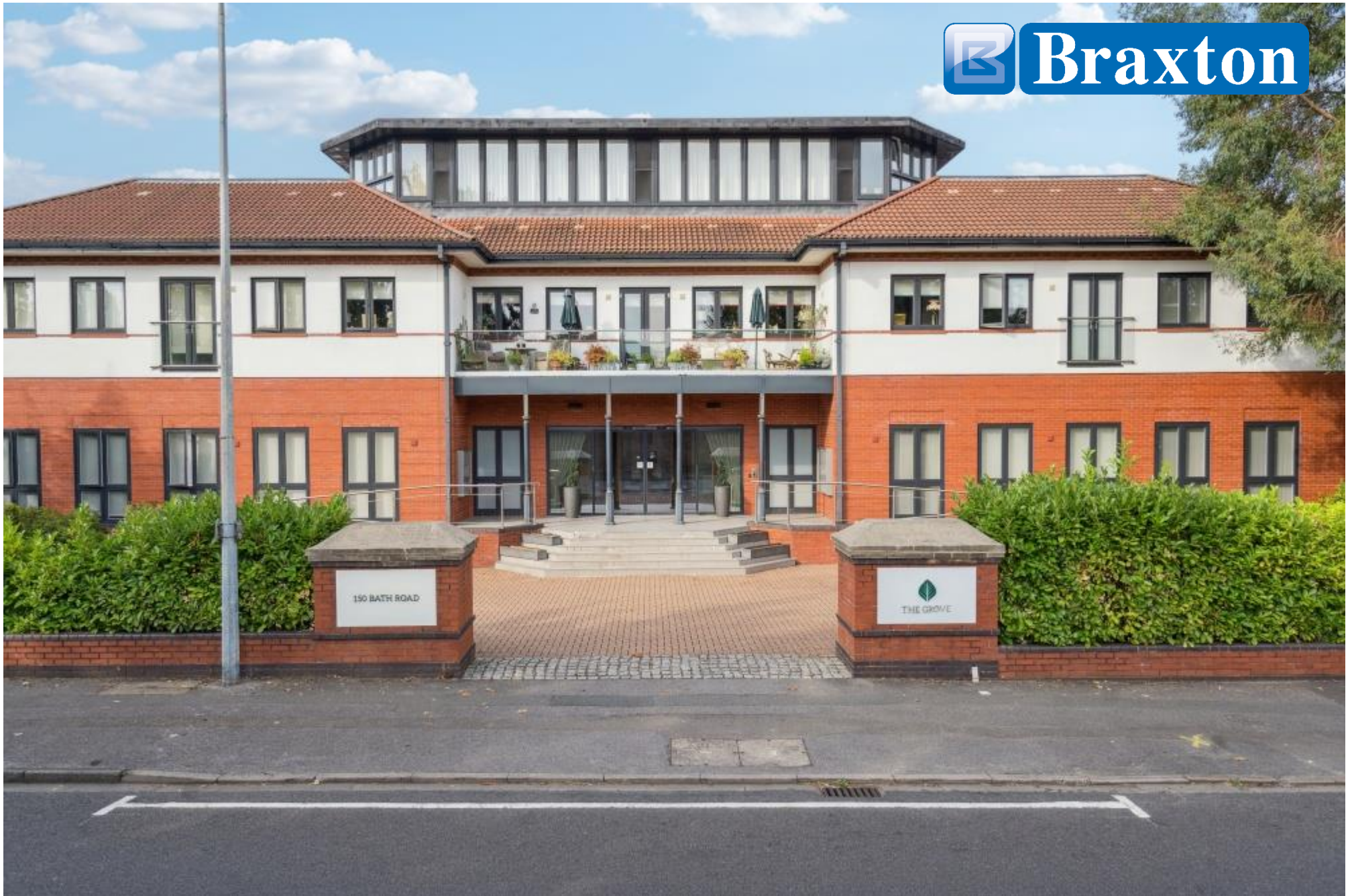
6 The Grove, 150 Bath Road, Maidenhead, Berkshire SL6 4LB