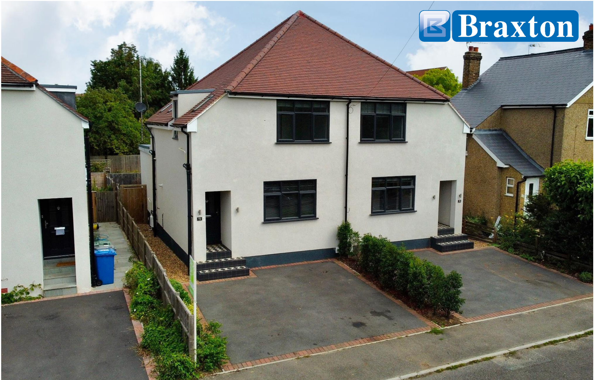
72 Blackamoor Lane, Maidenhead, Berkshire, SL6 8RG