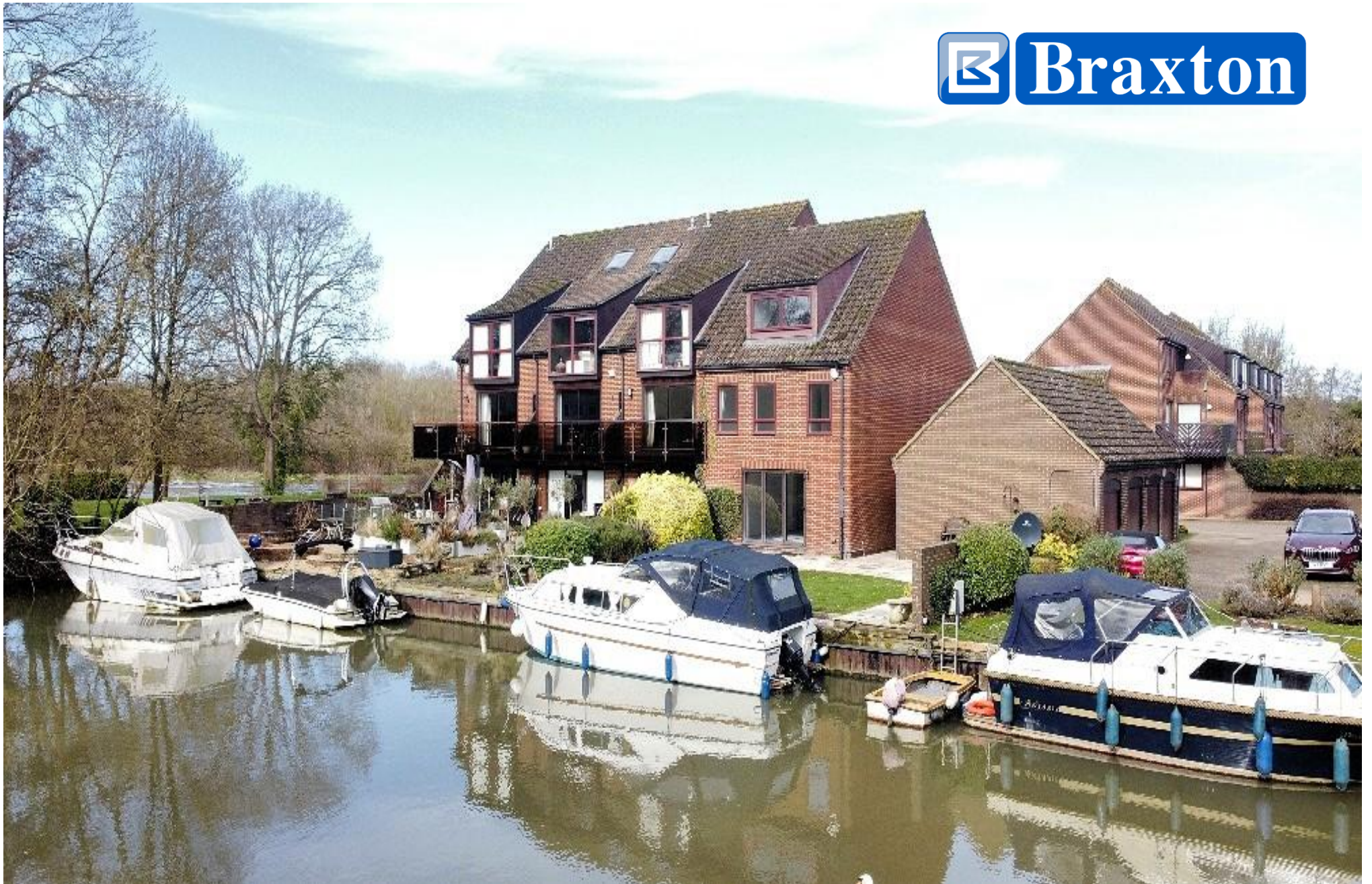
12 TEMPLE MILL ISLAND, MARLOW, BERKSHIRE, SL7 1SG