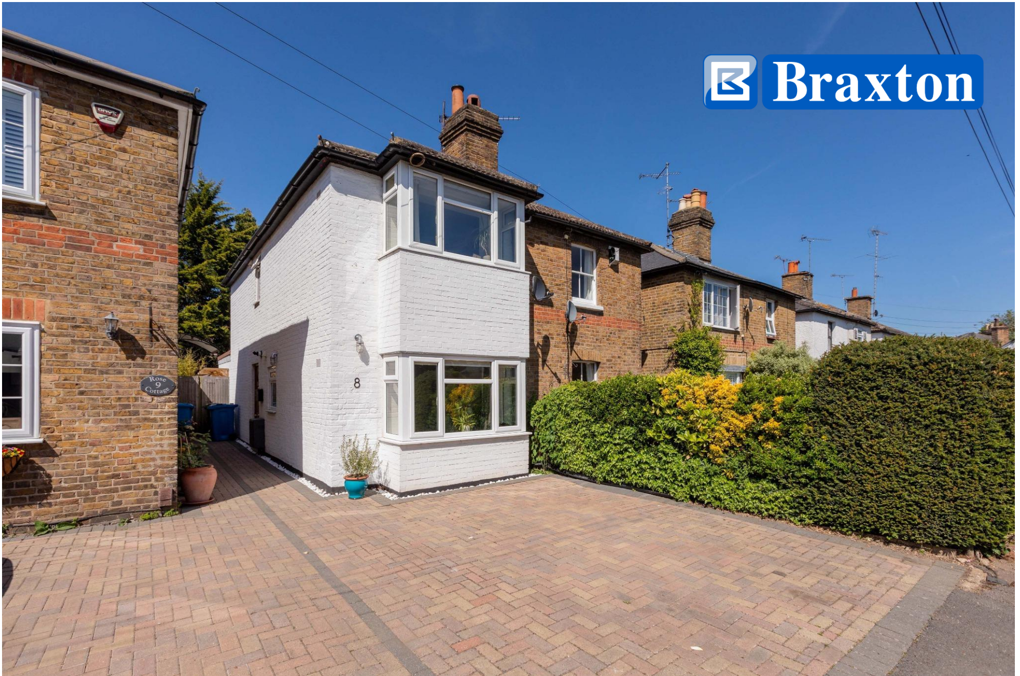
8 NORFOLK PARK COTTAGES, MAIDENHEAD, BERKSHIRE, SL6 7DR