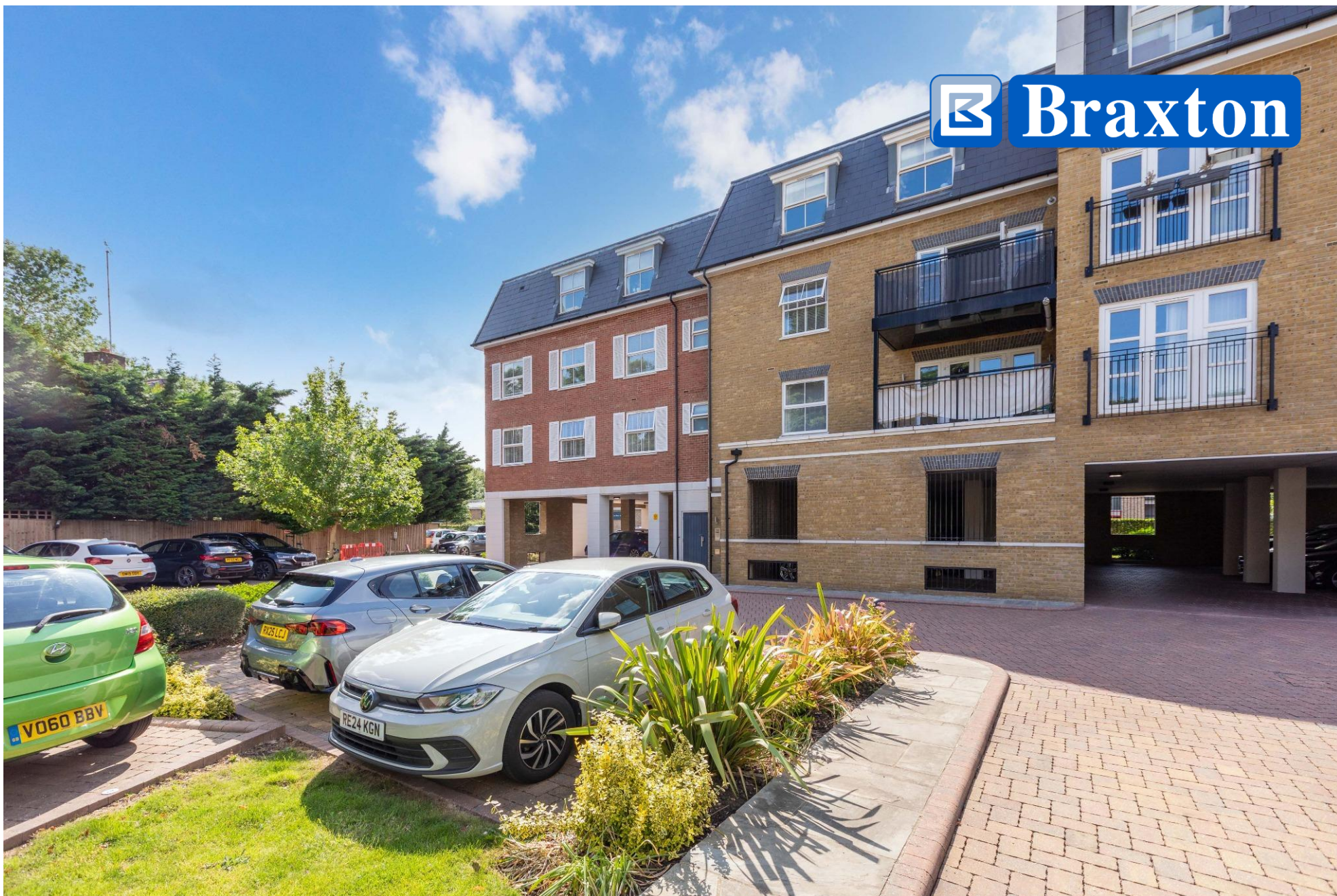
3 AMBER PLACE, OLDFIELD ROAD, MAIDENHEAD, BERKSHIRE, SL6 1AG