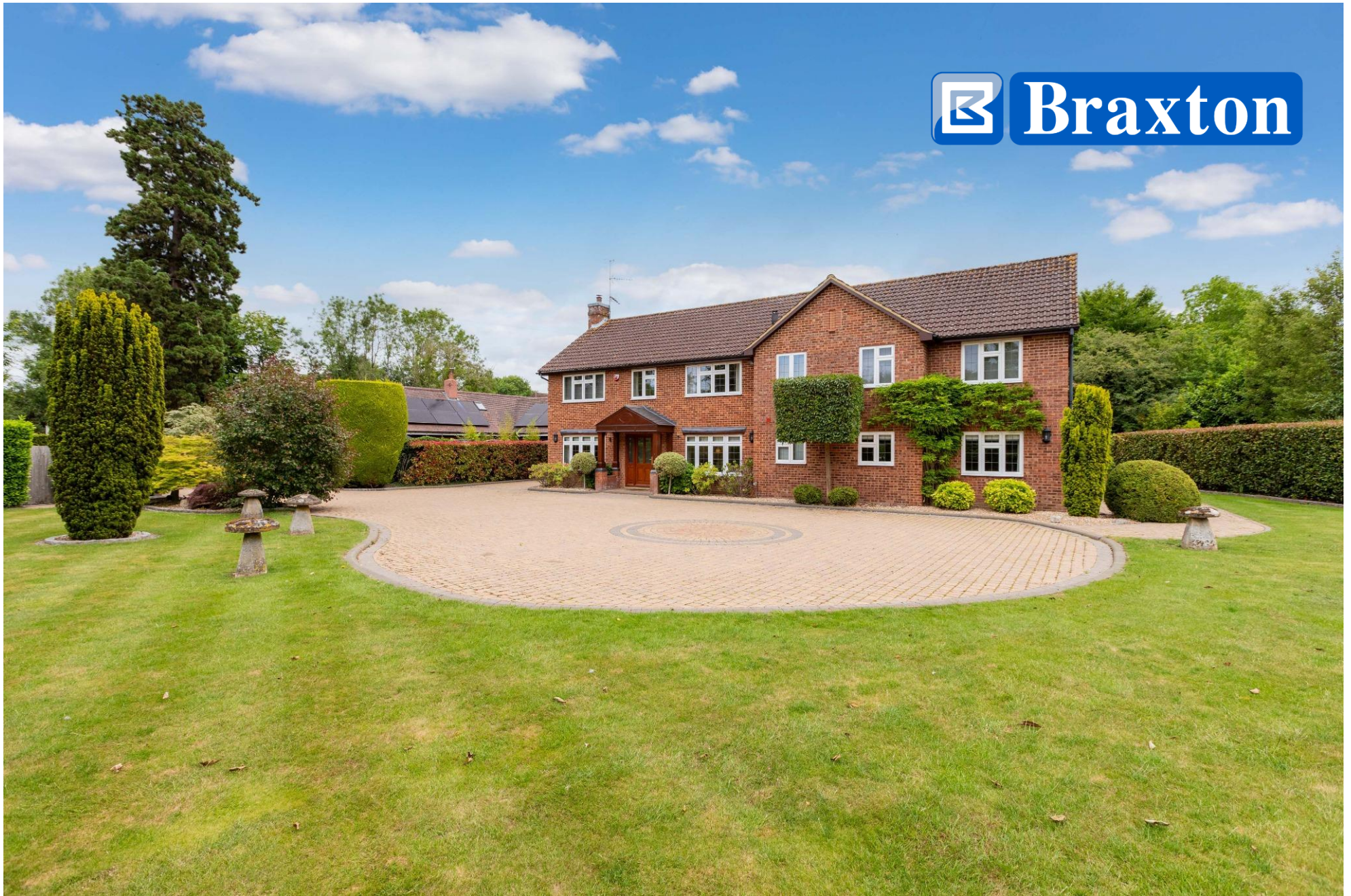
WINTER HOUSE, WALTHAM ROAD, WHITE WALTHAM, BERKSHIRE, SL6 3SH