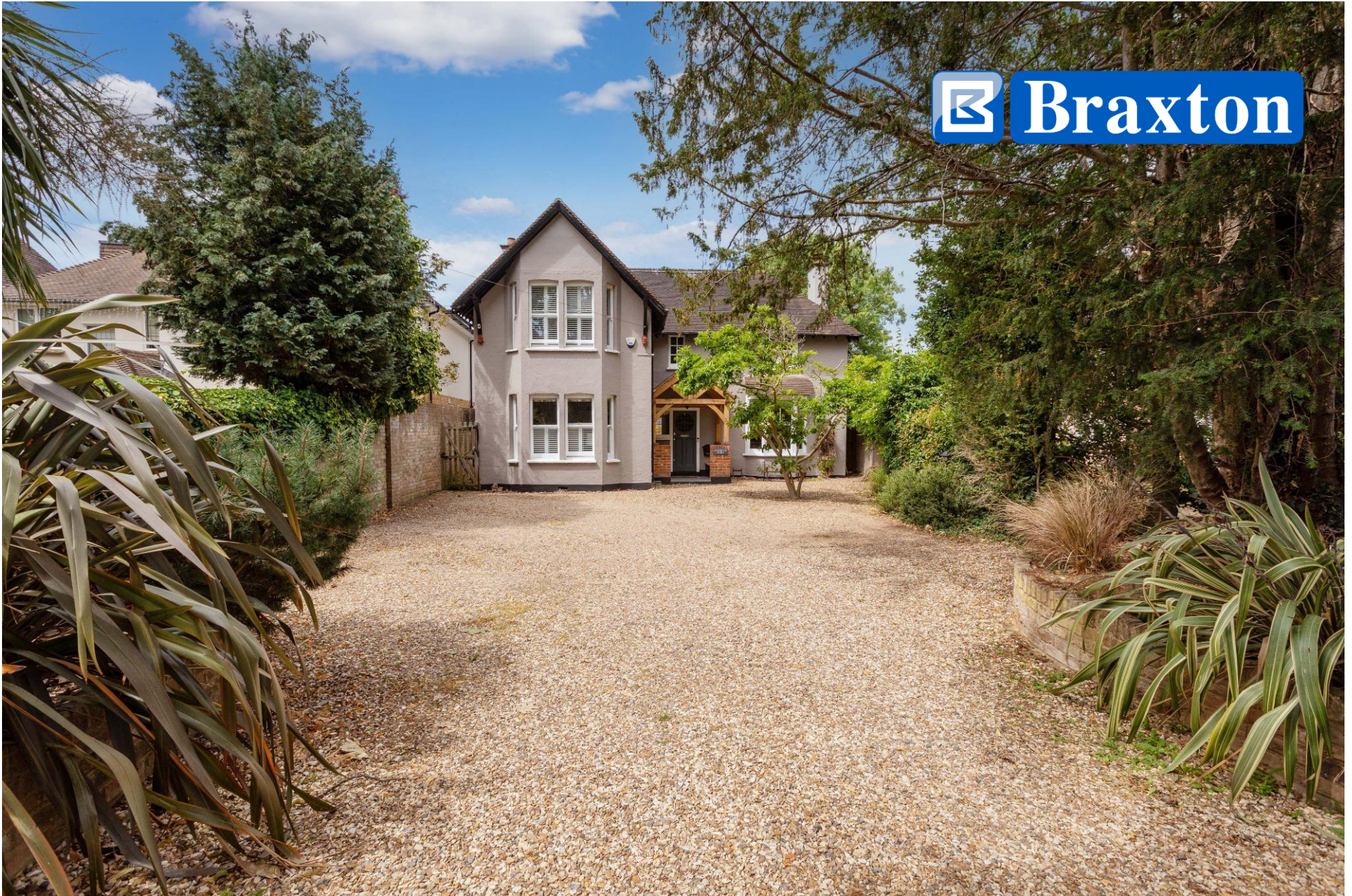
DODBROOK HOUSE, ALTWOOD BAILEY, MAIDENHEAD, BERKSHIRE, SL6 4PQ