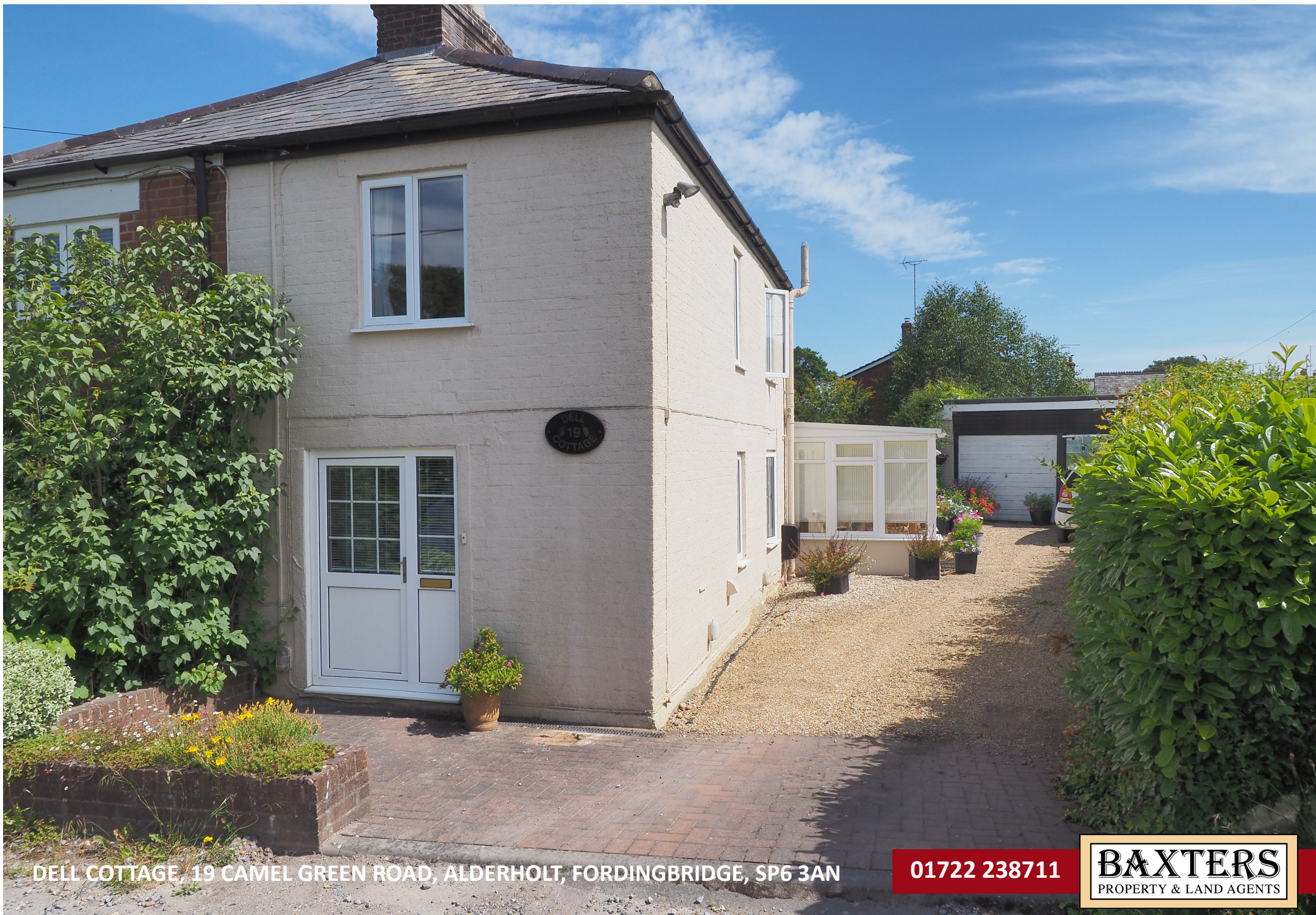
DELL COTTAGE, 19 CAMEL GREEN ROAD, ALDERHOLT, FORDINGBRIDGE, SP6 3AN