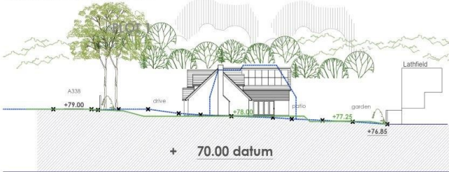
Proposed site sections a-a @ 1:250