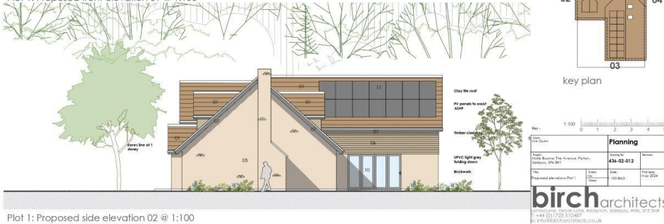
Plot 1: Proposed side elevation 02 @ 1:100