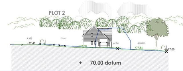
Proposed site sections b-b @ 1:250