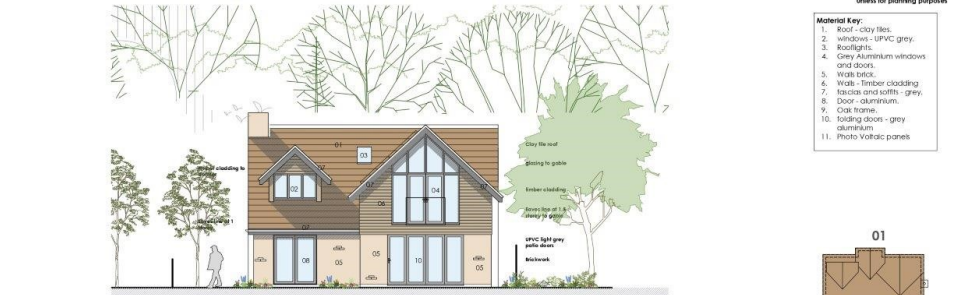
Plot 1: Proposed front elevation 03 @ 1:100