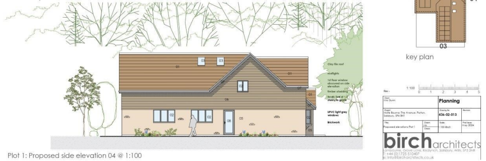
Plot 1: Proposed side elevation 04 @ 1:100