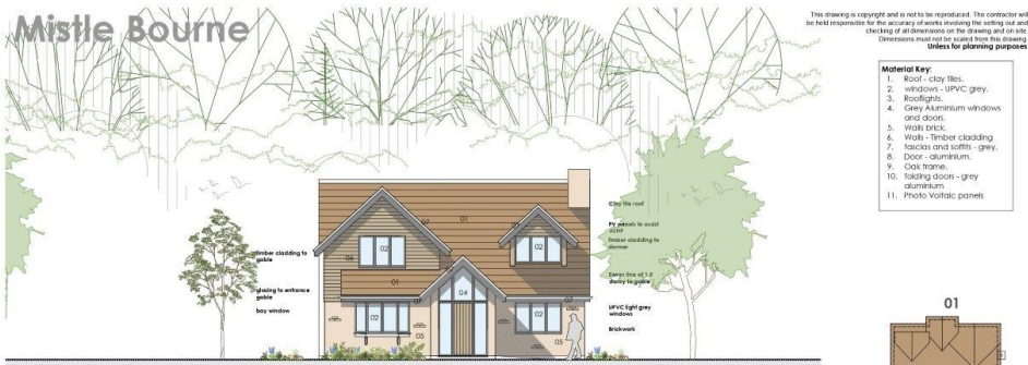
Plot 1: Proposed front elevation 01 @ 1:100