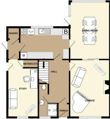
GROUND FLOOR 876 sq.ft. (81.4 sq.m.) approx.