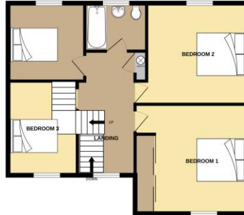
1ST FLOOR 717 sq.ft. (66.6 sq.m.) approx.