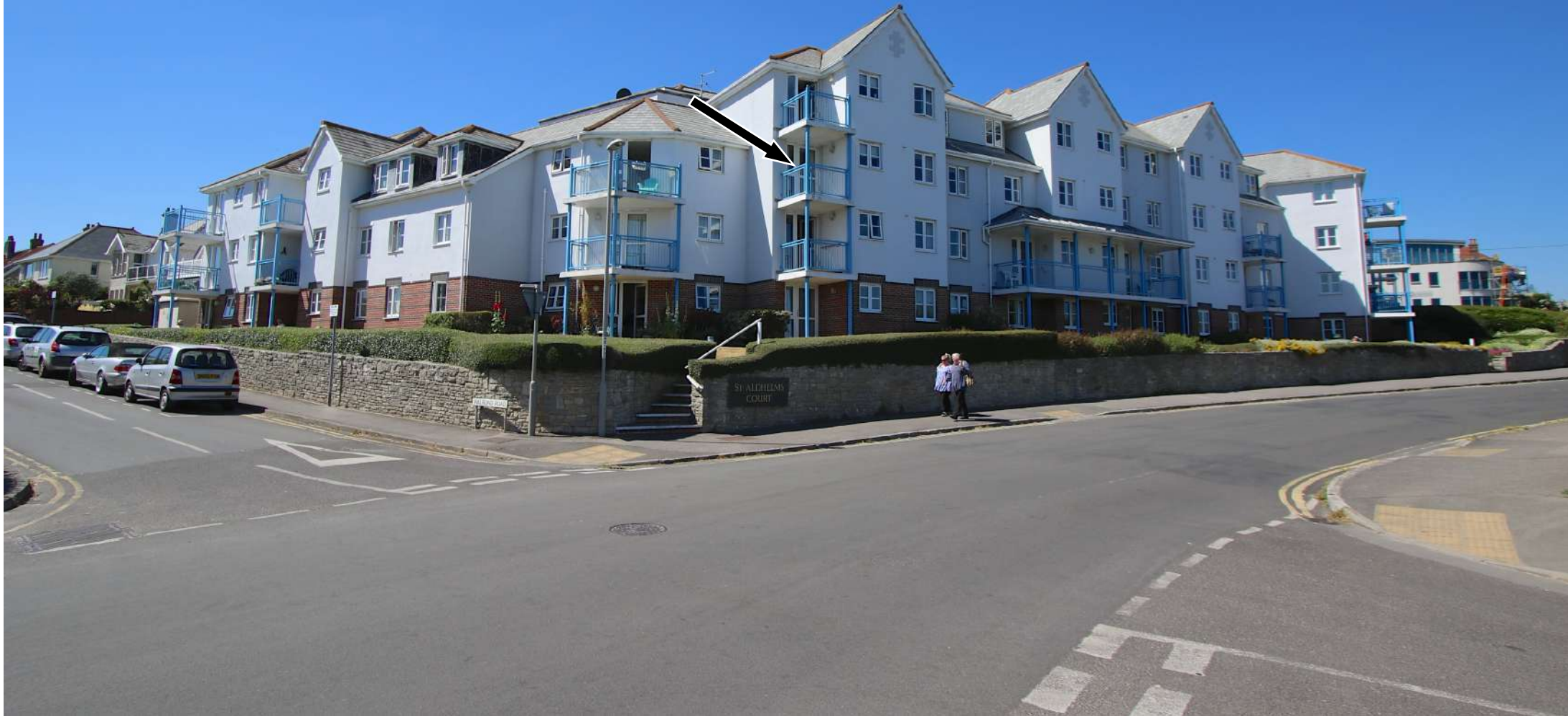
47 ST. ALDHELMS COURT, DE MOULHAM ROAD, SWANAGE £315,000 Leasehold