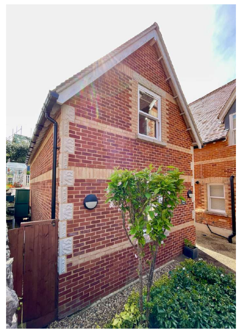
THE PROPERTY MISDESCRIPTION ACT 1991 You are advised to check the availability of this property before travelling any distance to view. The Agent has not tested any apparatus, equipment, fixtures and fittings or services and so cannot verify that they are in working order or fit for the purpose. References to the Tenure of a Property are based on information supplied by the Seller. The area of the building is given for guidance purposes only and must be verified by the purchasers surveyor. A Buyer is advised to obtain verification of this information from their Solicitor and/or Surveyor. FLOOR PLANS The floor plans supplied are for guidance purposes only and should not be used for measuring. Small recesses, cupboards & sloping ceilings may not appear on the plans. LOCATION PLAN The location plans supplied are for identification purposes only and are reproduced from the Ordnance Survey Map with permission of the Controller of H.M. Stationery Office. Crown Copyright