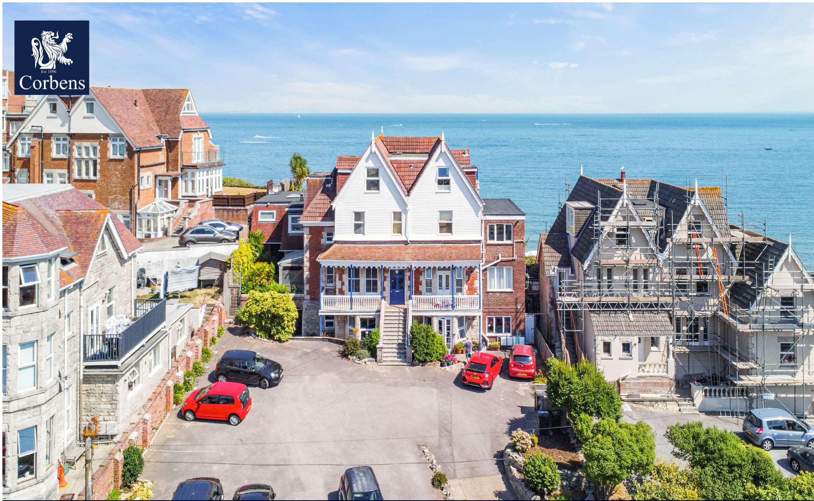
7 KINGSLEY HALL, ULWELL ROAD, SWANAGE Guide £599,950 Leasehold