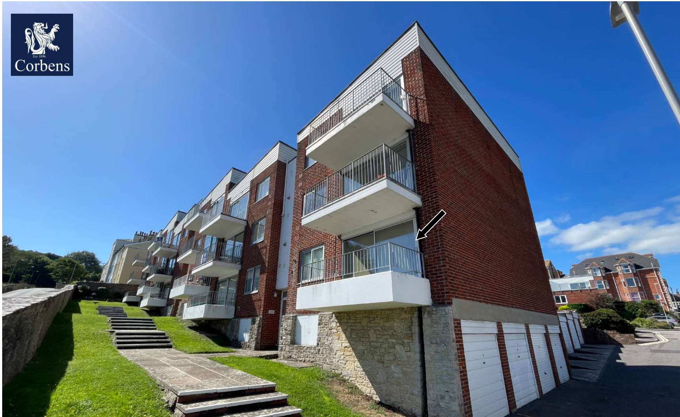
11 PEVERIL HEIGHTS, SENTRY ROAD, SWANAGE £460,000 Shared Freehold