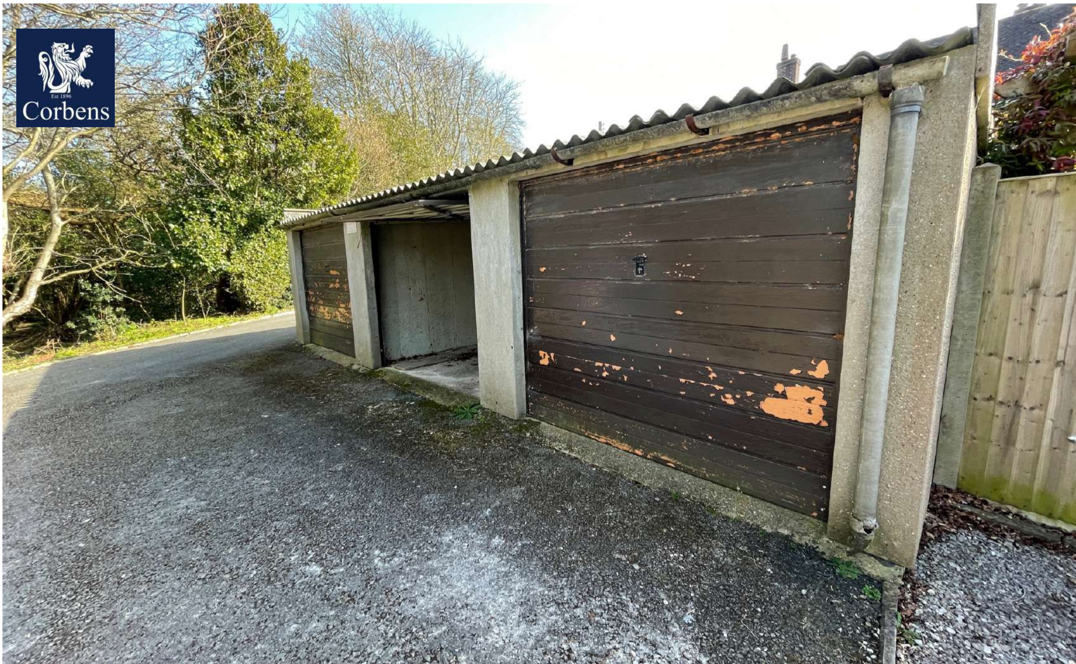
SINGLE GARAGE (Left), OFF HEATHGREEN ROAD, STUDLAND £150PCM