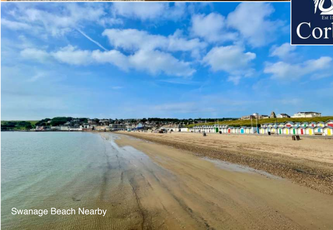
Swanage Beach Nearby