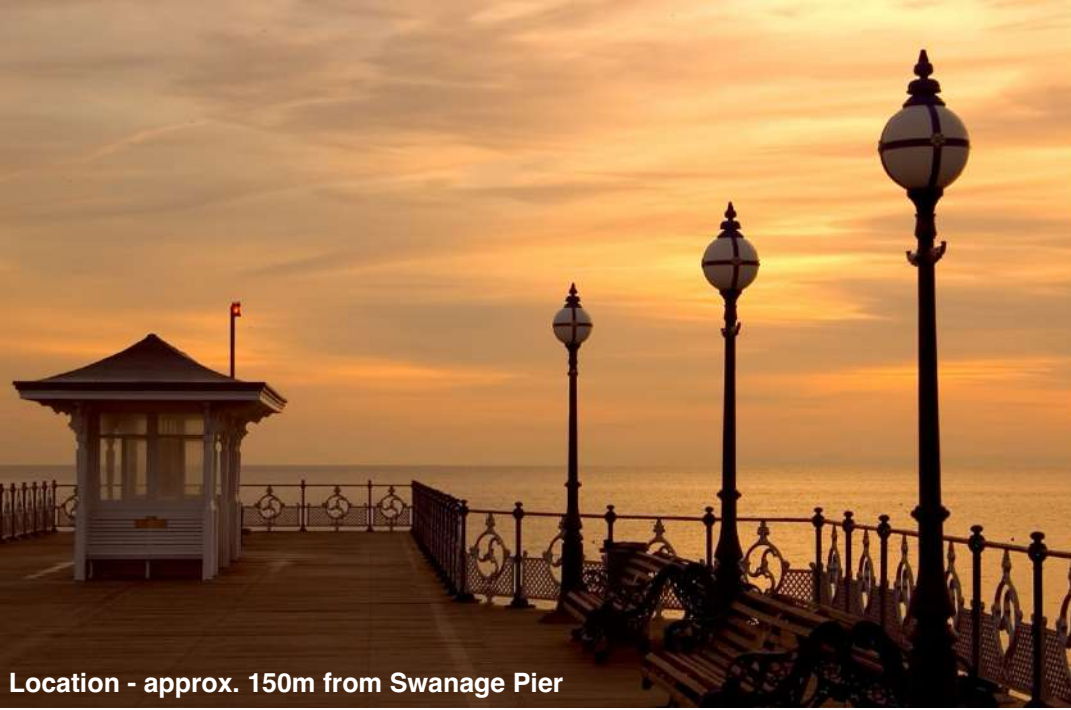
Location - approx. 150m from Swanage Pier