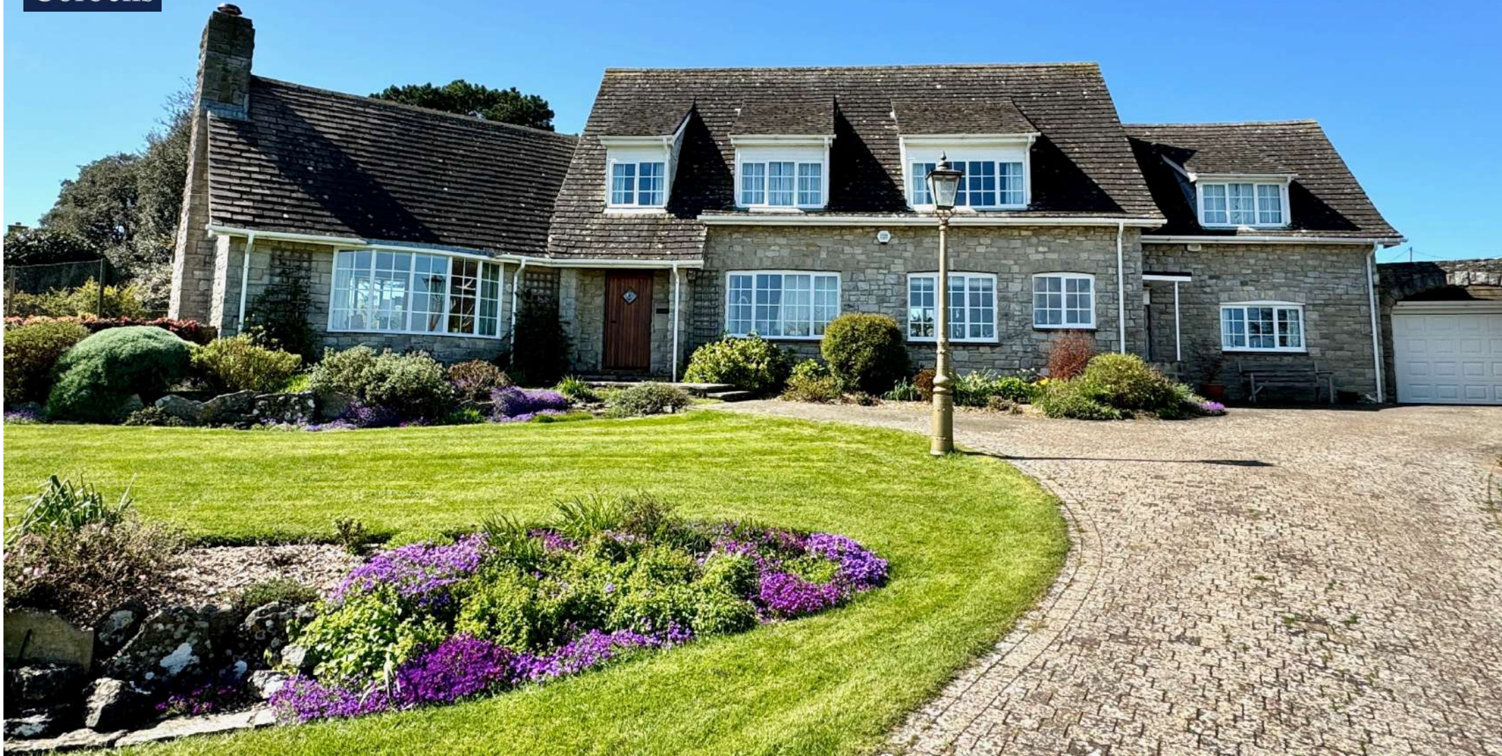
SUMMERHILL, 18 RUSSELL AVENUE, SWANAGE Guide £1,600,000