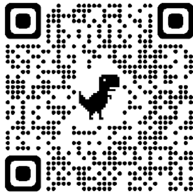
Scan to View Video Tour