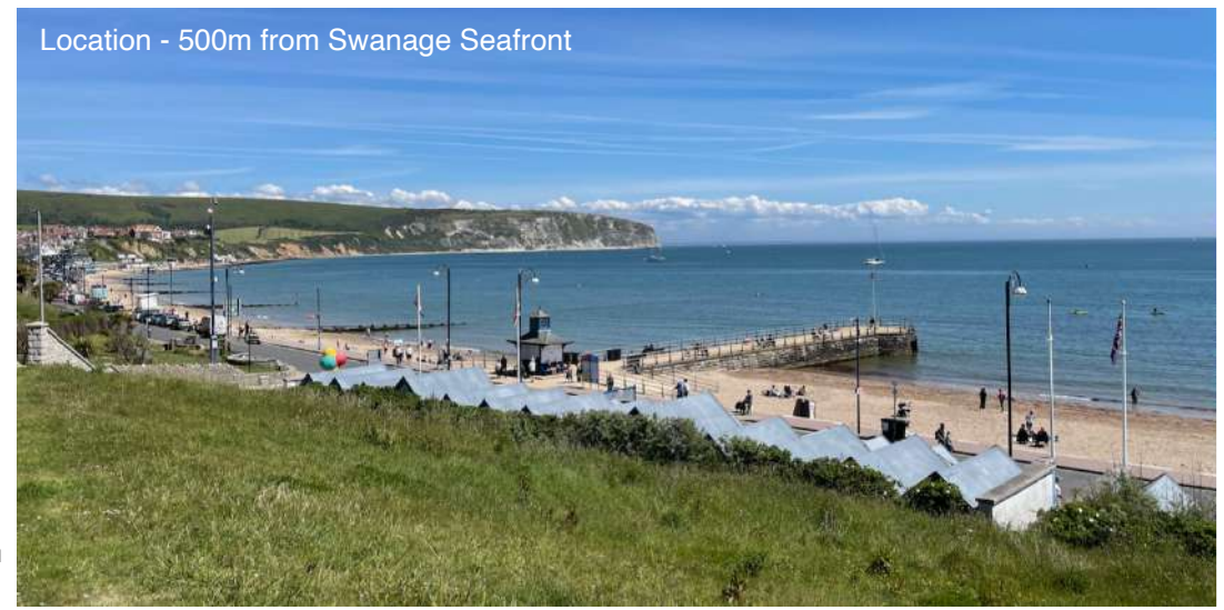
Location - 500m from Swanage Seafont

Total Floor Area Approx. 83m 2 (893 sq ft)