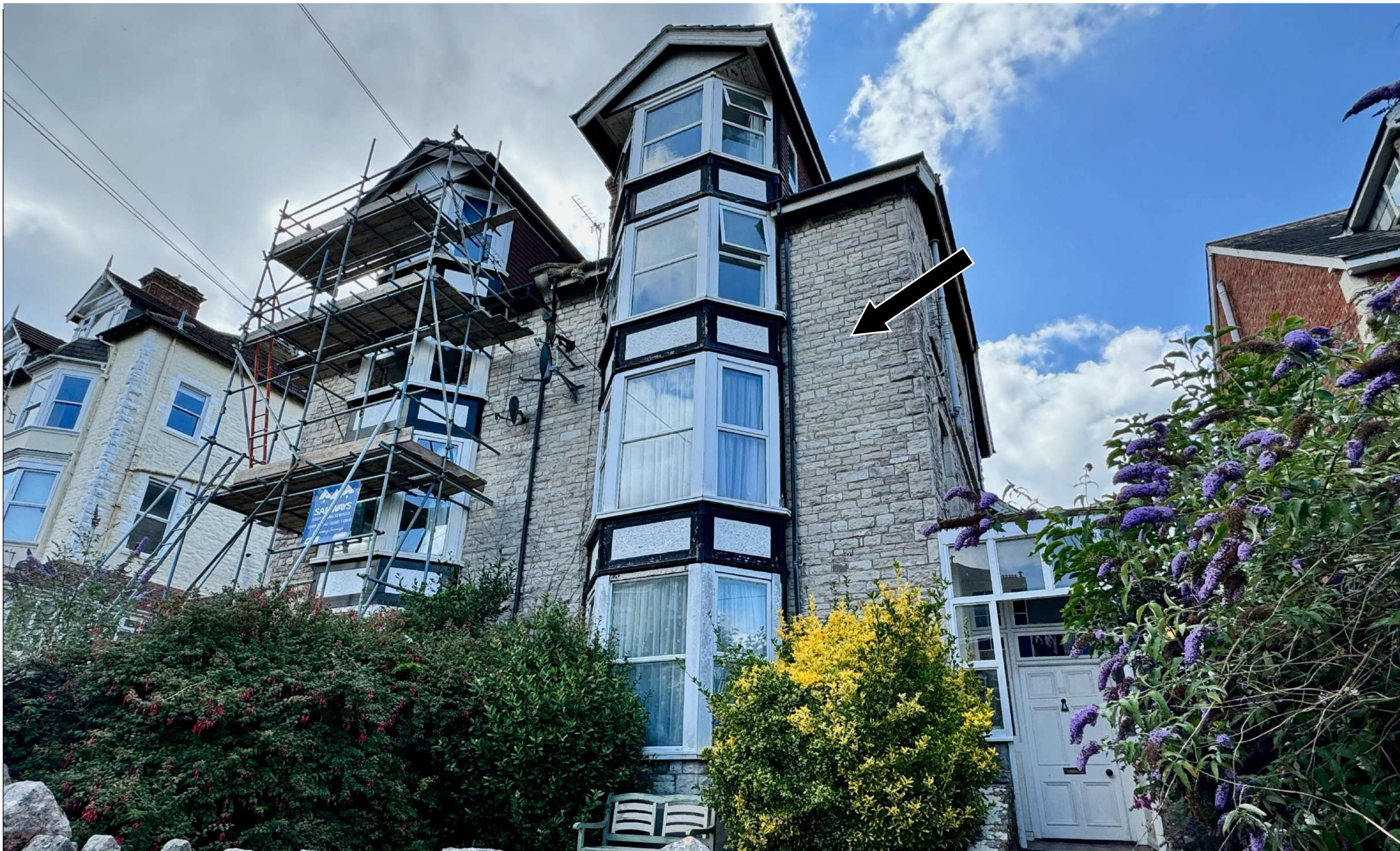
FLAT 2, 28 PARK ROAD, SWANAGE £175,000 Shared Freehold