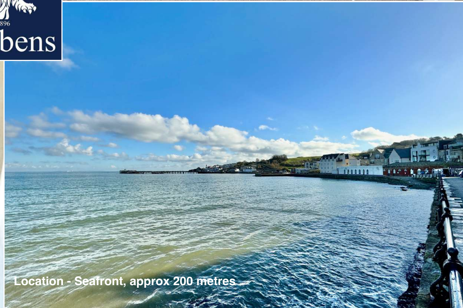
Location - Seafront, approx 200 metres