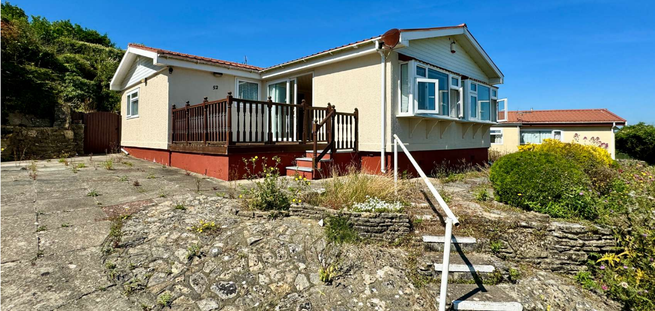
52 HOBURNE PARK, SWANAGE £275,000 Leasehold