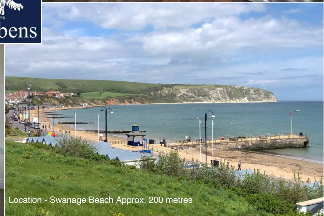
Location - Swanage Beach Approx. 200 metres