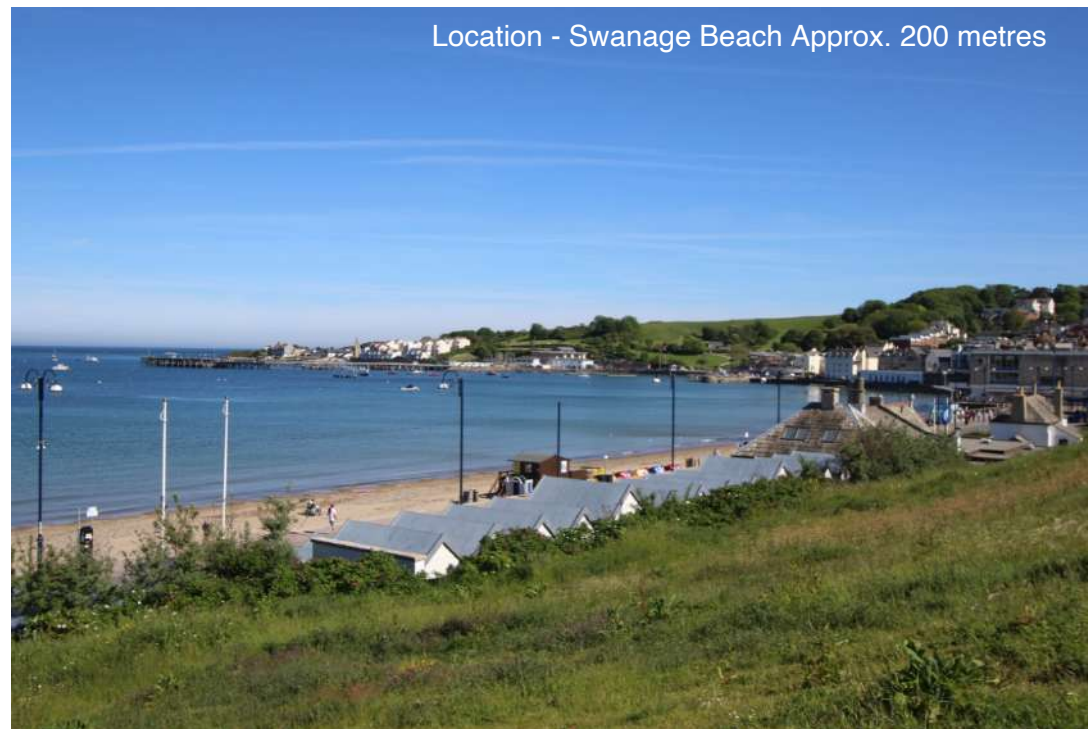
Location - Swanage Beach Approx. 200 metres

The wide entrance hall leads to the exceptionally spacious living room with South facing bay and access to the attractive South facing balcony giving views over the town. The separate kitchen is fitted with a range of white gloss units, contrasting worktops, integrated double oven and gas hob with a stainless steel extractor fan over.