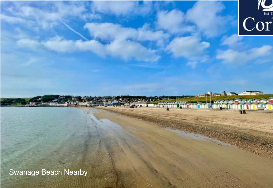
Swanage Beach Nearby