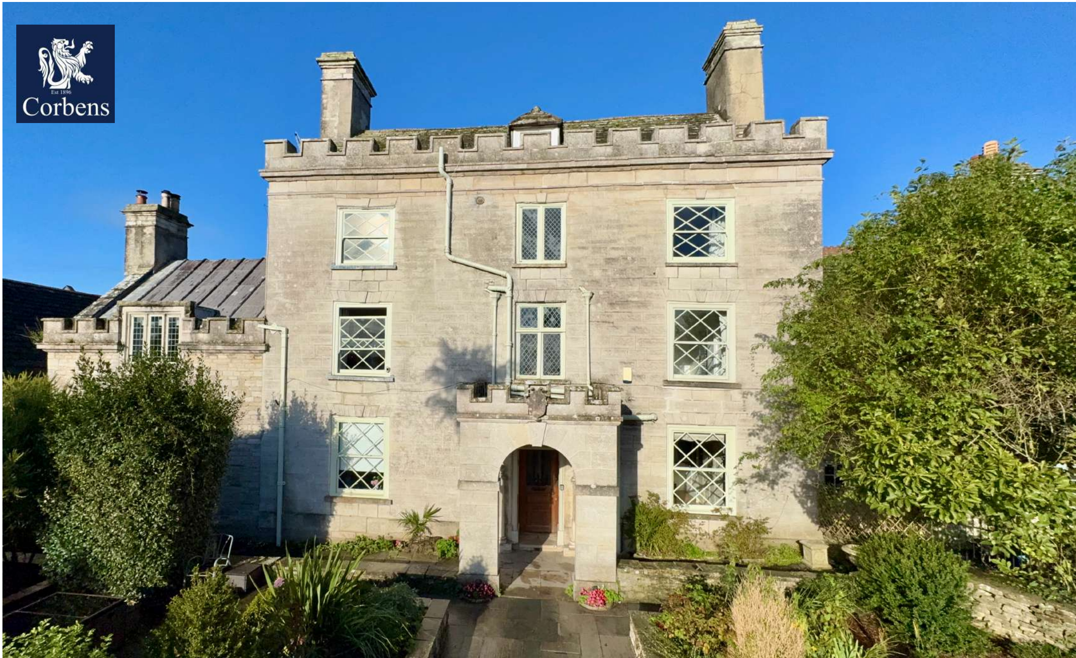
NEWTON MANOR HOUSE, HIGH STREET, SWANAGE £1,500,000 Freehold