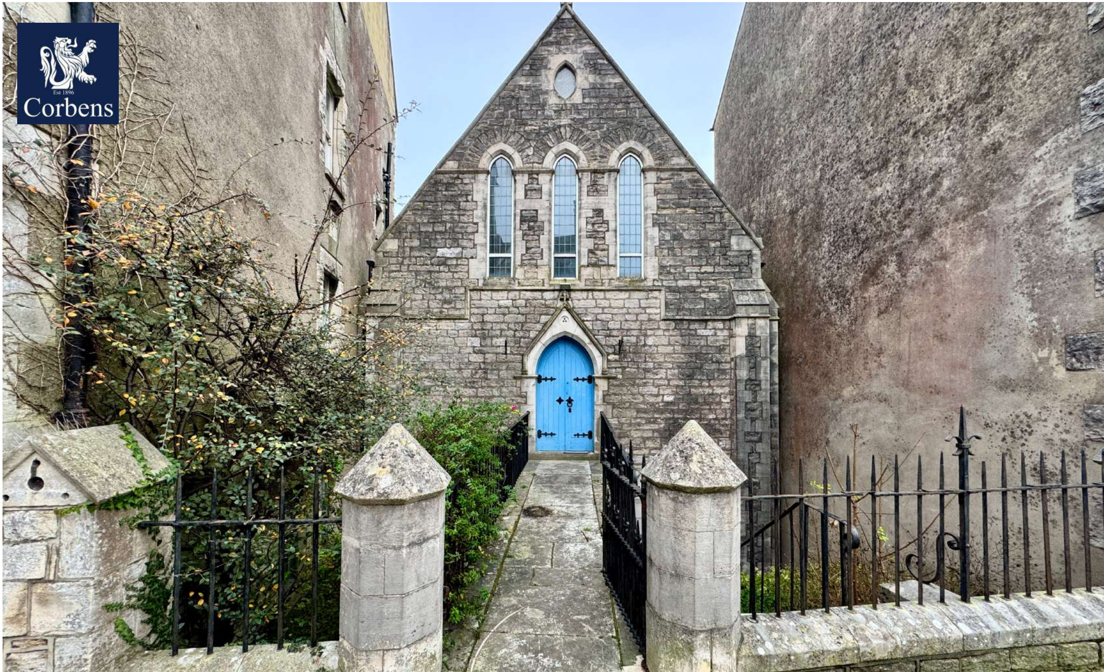
THE SALVATION ARMY HALL, 54 HIGH STREET, SWANAGE £350,000 Freehold