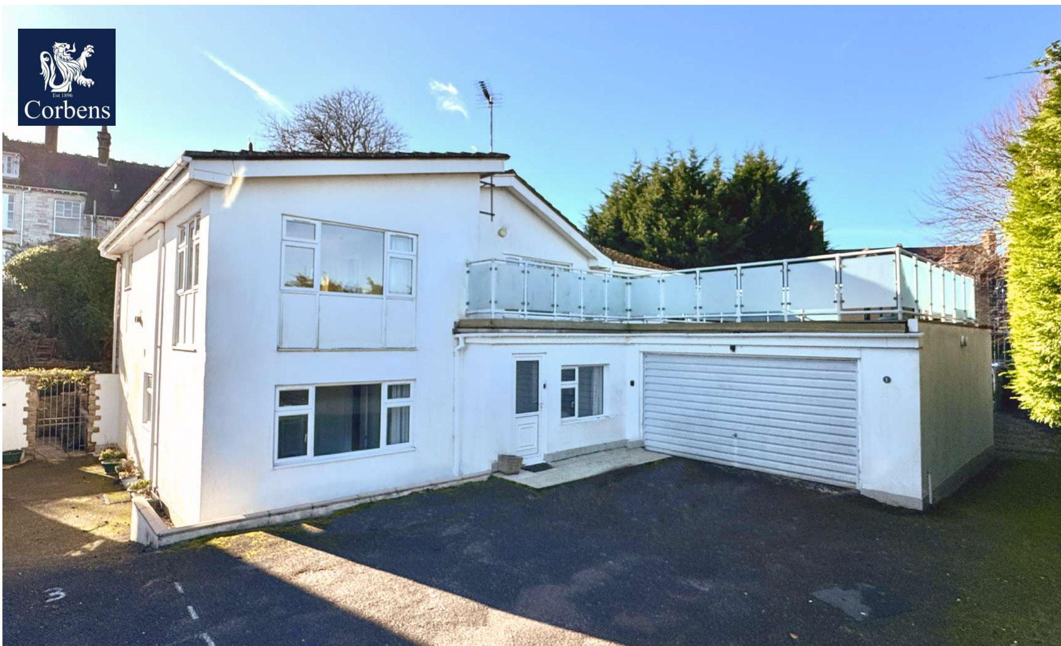
1 CLUNY CRESCENT, SWANAGE £890,000 Freehold