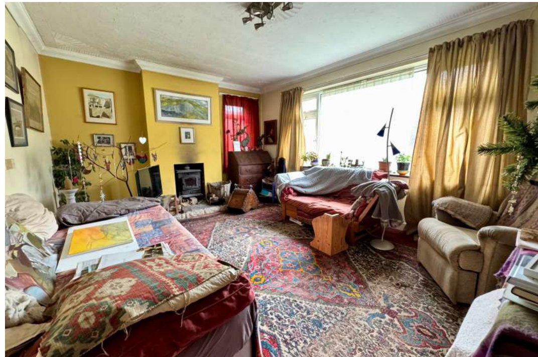
The spacious hallway is central to the accommodation. Leading off, the South facing living room is particularly light enjoying dual aspects and has a fitted wood burning stove. The spacious kitchen is at the front of the bungalow and is fitted with a range of white units with tiled worktops, integrated gas hob and electric oven. There is access to the garden from this room.

There are two good sized double bedrooms, both with fitted wardrobes. Bedroom 2 is South facing. The family bathroom is fitted with a suite comprising panelled bath and pedestal wash hand basin. A separate WC completes the accommodation.