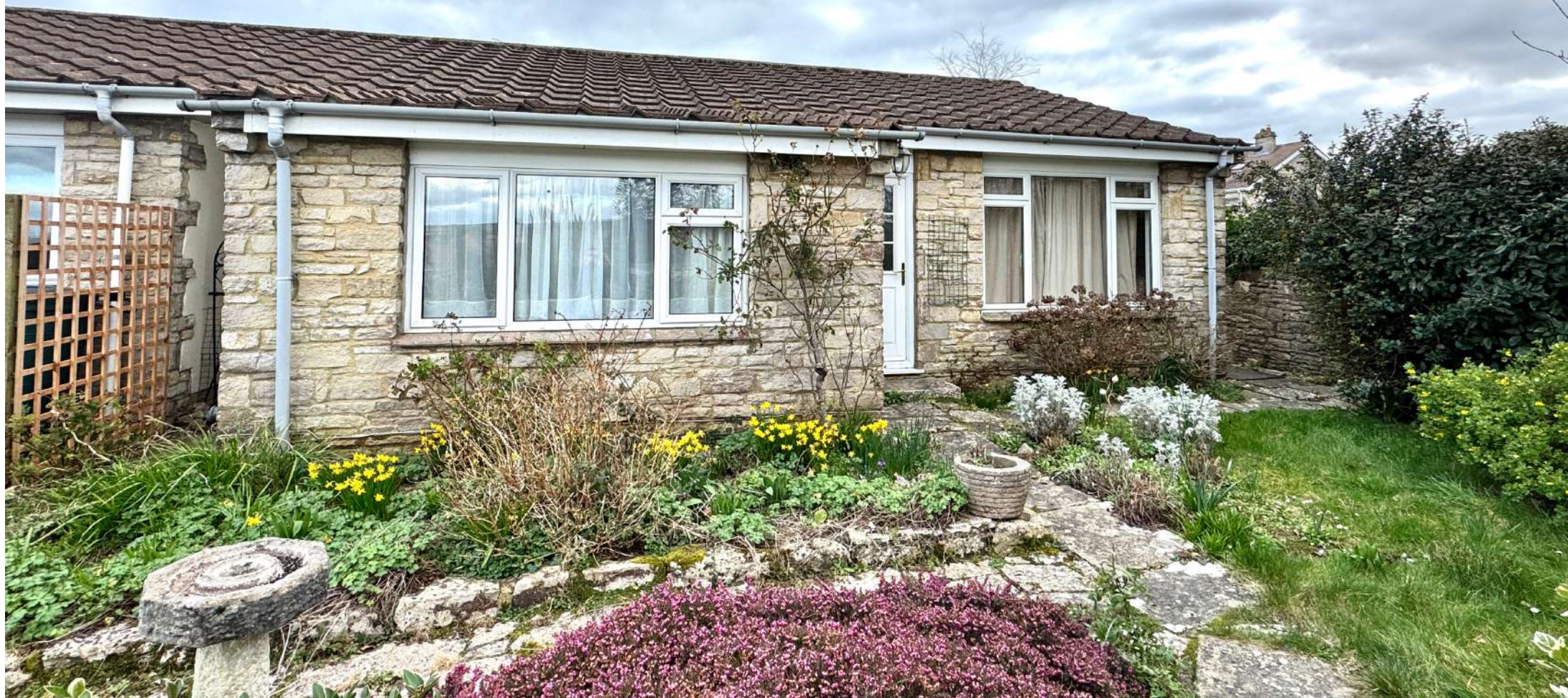
4 HEATHER CLOSE, HIGH STREET, SWANAGE £365,000 Freehold