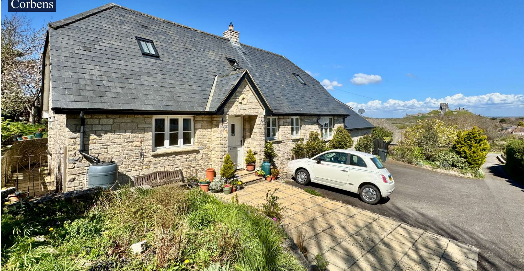
APPLETREES, WEST STREET, CORFE CASTLE Guide £1,500,000 Freehold