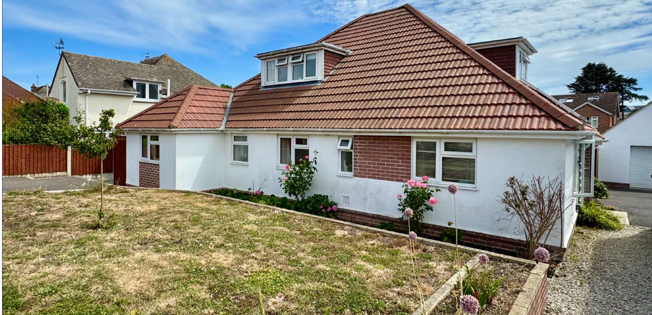
19 BATTLMEAD, SWANAGE £895,000 Freehold